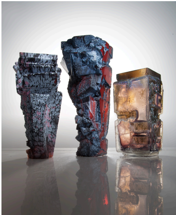
Wolfe will spend hours, if not days, perfecting a Styrofoam form in his studio. But when it comes to color, "the final decision happens the morning of the glass-blowing in the glass room," he says. "It's almost like there are two separate parts of the process." Left to right: Assemblage , 2015, blown, cut, and polished glass, 11.5 x 5.5 x 6 in.; Facet Assemblage , 2015, blown, cut, and polished glass, 13.5 x 5.5 x 7 in.; Assemblage , 2015, blown, cut, and polished glass, 10 x 5.25 x 5.25 in.

Over time, his modeling has evolved. Lightweight Styrofoam is easy to manipulate and eventually helped him increase the scale of the work, Wolfe says. Today, it's not uncommon for him to have four or five positives going in his studio, as he cuts, carves, and reassembles them in a meticulous yet improvisational pursuit of form. "I spend a lot of time constructing them and then just thinking about them as they are," he says. He sketches to record ideas of what to make – but those sketches often bear little resemblance to the finished works.