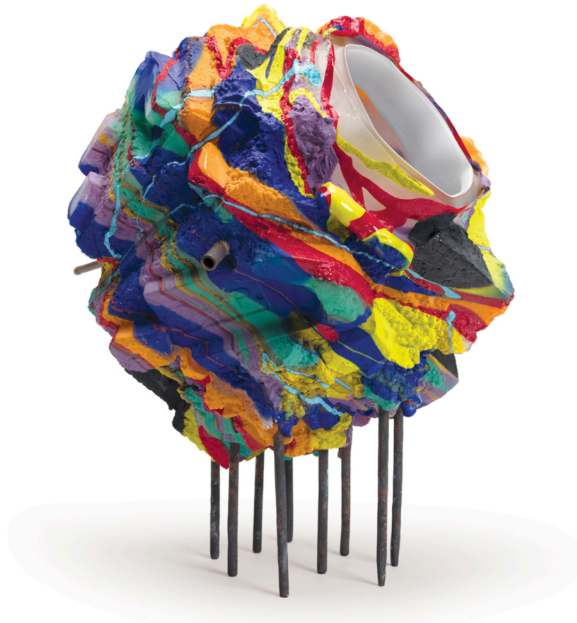
Wolfe says he’s moving away from the vessel “into an experimental architecture of form.” Left: Untitled , 2017, blow glass, bronze, 15.5 x 13.5 x 11 in.

“But,” he adds in his amiable, laid-back way, “it always takes a while.”