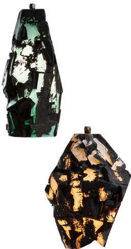
Left: Facet Assemblage pendants , 2012, cut and polished glass, 16 in. tall