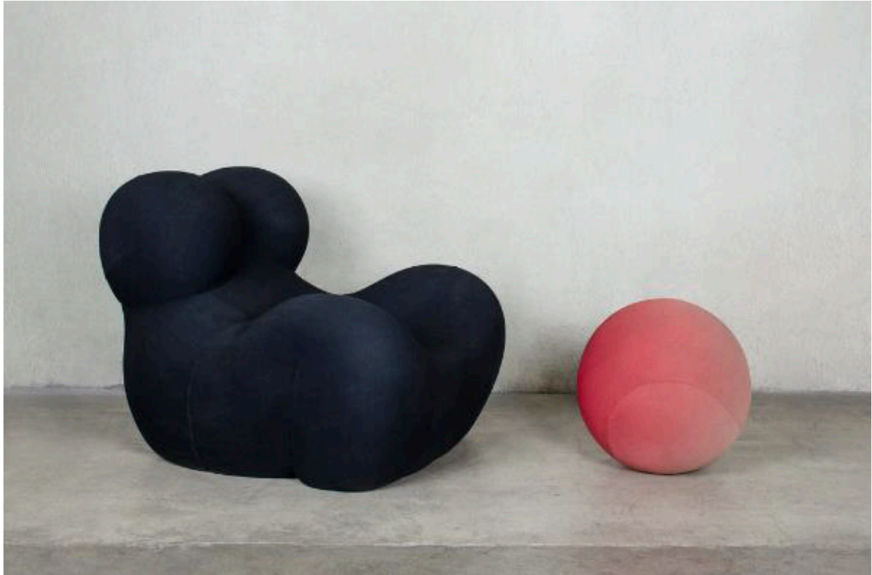
Mr. Pesce's Up5 armchair with Up6 pouf, of polyurethane foam structure and elastic fabric upholstery, for B&B, from Casa Carenza, 1969. It is at Friedman Benda.

He soon abandoned the exalted objects of High Modernism. In Chelsea, in a complementary show, specimens from his early experiments from the '60s through the '90s, are exhibited in "Gaetano Pesce: Age of Contaminations," a show at Friedman Benda (through Dec. 14). Unlike the objects in "Working Gallery," expressions of a fully developed aesthetic, this collection of 20 or so rarely assembled furnishings, some commissioned for private homes, show the trials he matured through to arrive at his performance on Fifth Avenue.