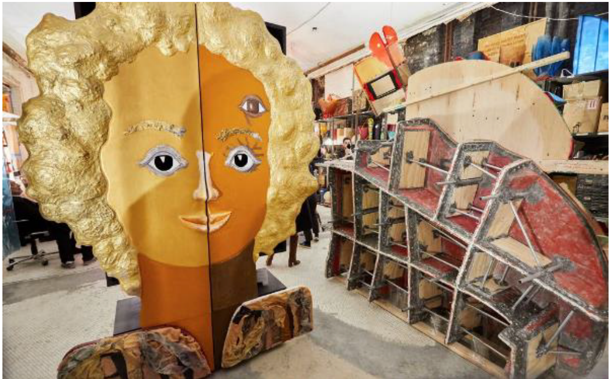
Installation view of the pop-up studio, “Working Gallery,” at Salon 94. Mr. Pesce often paints whimsical faces on cabinets and doors, breaking with Modernism’s abstraction, blurring the boundary between art and design.

If the setting looked authentic, that’s because seven trucks loaded with the contents of Mr. Pesce’s Brooklyn studio had transported his working archive here, along with the table saws, lathes and tool sets that he uses to create his bestiary of imaginary creatures. Many objects in this haunted shop, whether a vase, chair, lamp or wall hanging, had lips, eyes or a face, and intimations of a soul. Vases sprouted centipede legs and wafting tendrils.