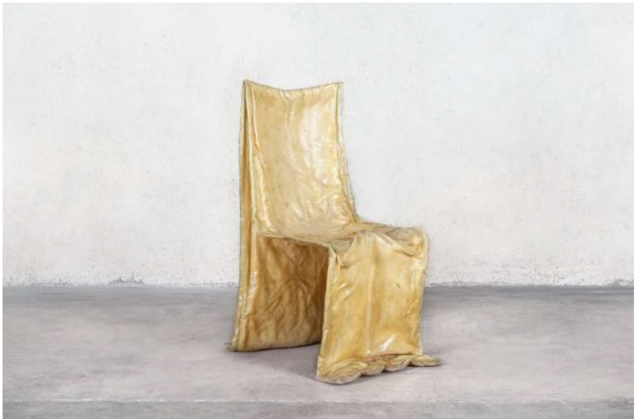
Mr. Pesce’s Golgotha Chair (1972) is in the MoMA collection, and is currently on view at Friedman Benda.

In Italy, where he came of age studying architecture at the University of Venice, Mr. Pesce rebelled against the idealized, simplified furniture and industrial objects of Milan’s Bel Disegno. He didn’t want to design the perfect spoon.