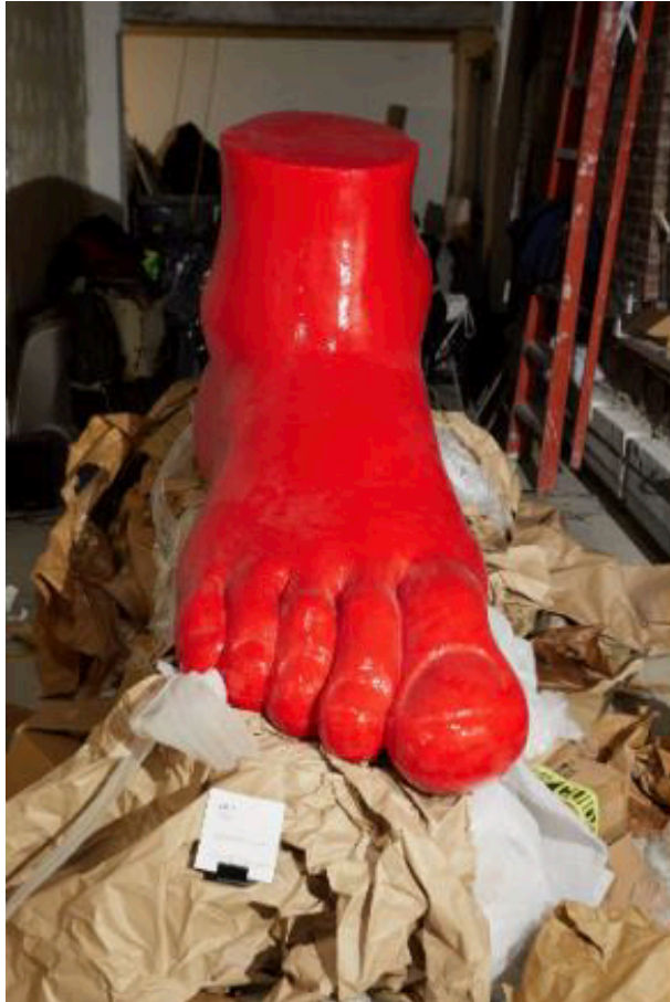
Mr. Pesce's big red foot is a typical piece of his lighthearted irony recalling the heroic stone sculpture of classical antiquity.

Some pieces stood on pigeon-toed feet, and others grew flippers, fins, fingers and toes. All were squishy to the touch, looking as if they would bounce if dropped. Visitors had basically walked into a home furniture store for a Hobbit world in Middle-earth — though nothing was for sale.