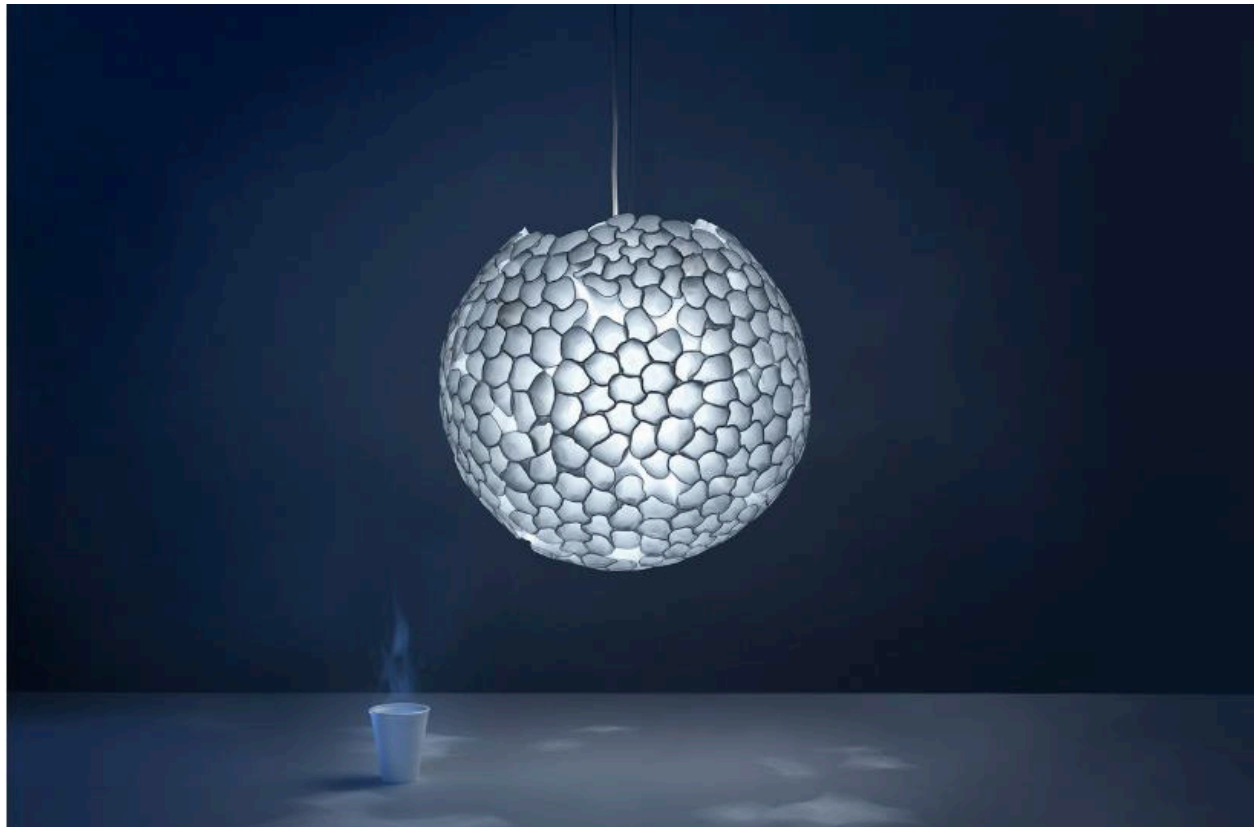
© Styrene by Paul Cocksedge for the Stepney Green Design Collection

An unfocused picture of the sun I took in Crete , sending out 360 degrees of glowing energy.