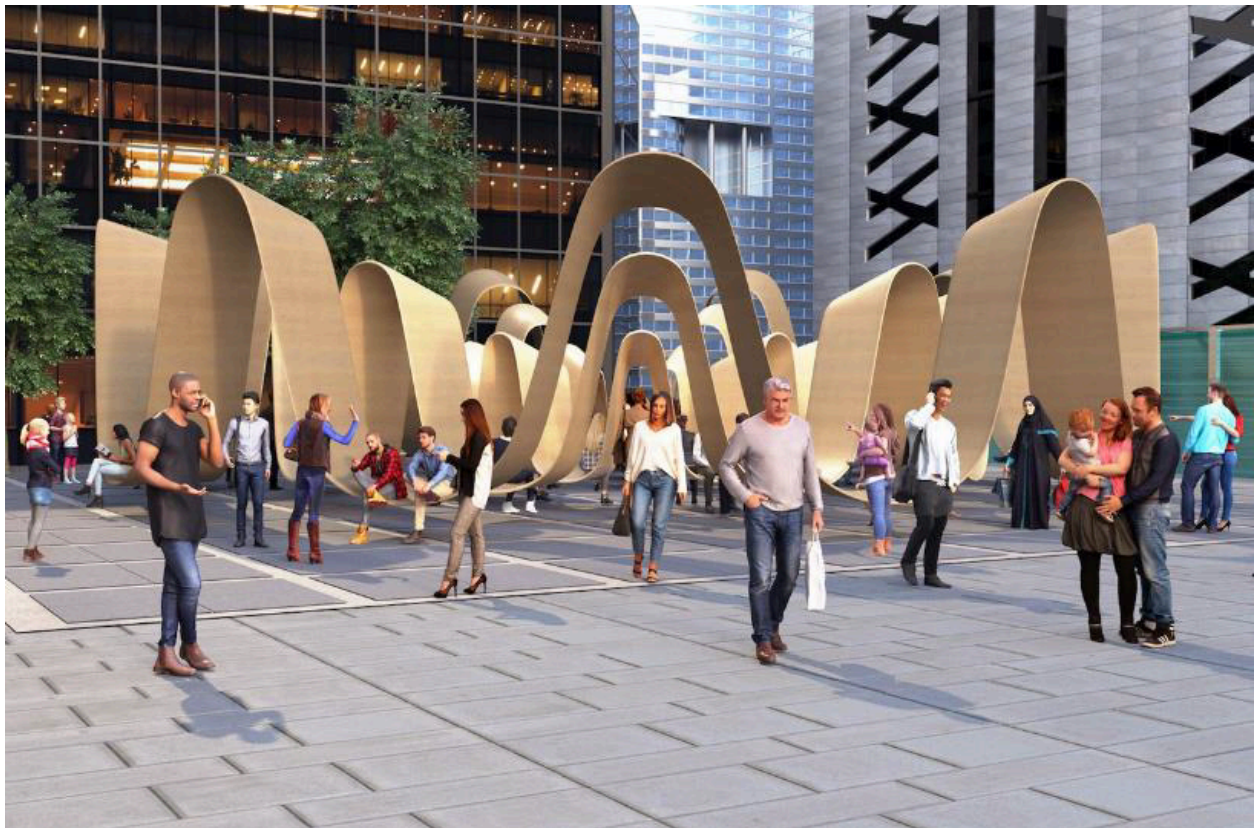
© Please Be Seated by Paul Cocksedge