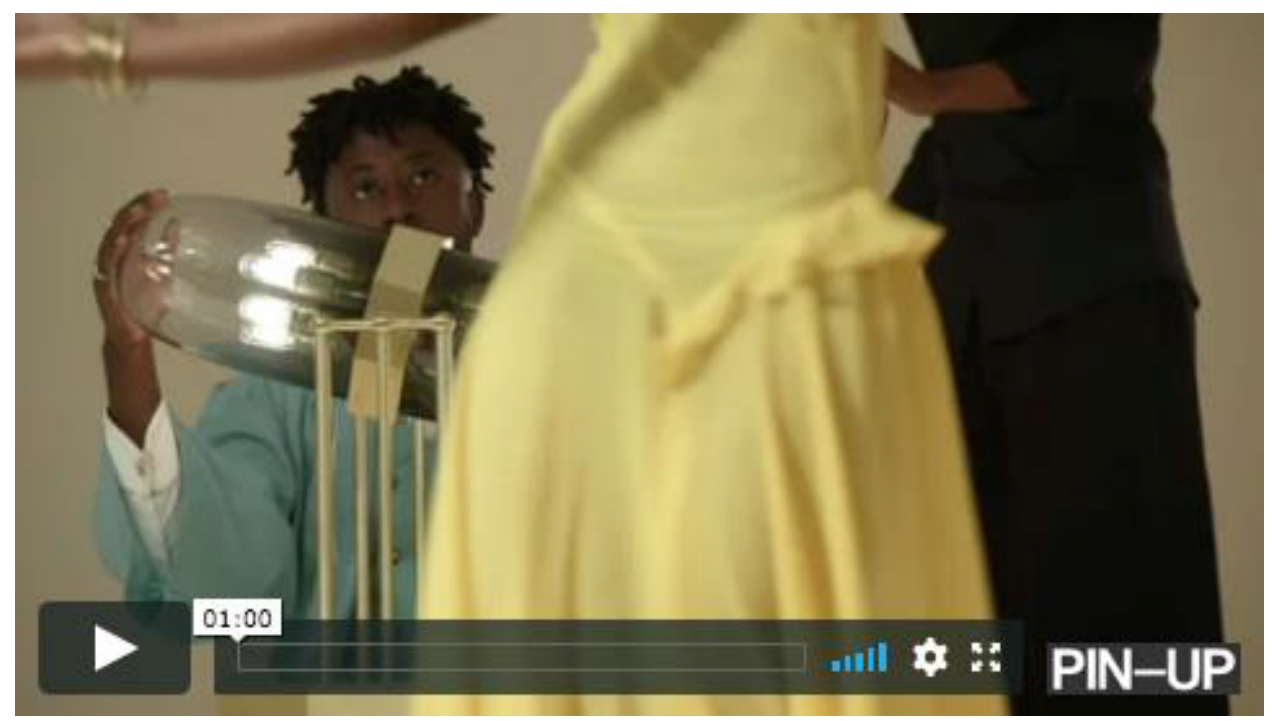
Clip from Ini Archibong, The Oracle (2019)

If you develop a good metaphor, everybody gets it. Direct and simple. I go to my glassblower and tell him, "these lamps need to feel like all the colors of a sunset rolled up into a single drop in the sky and landing at your feet in front of you." And he says, "Okay, let's make it." (Laughs.) An object should communicate an idea to the people coming in contact with it. It's a three-dimensional standing piece of poetry.