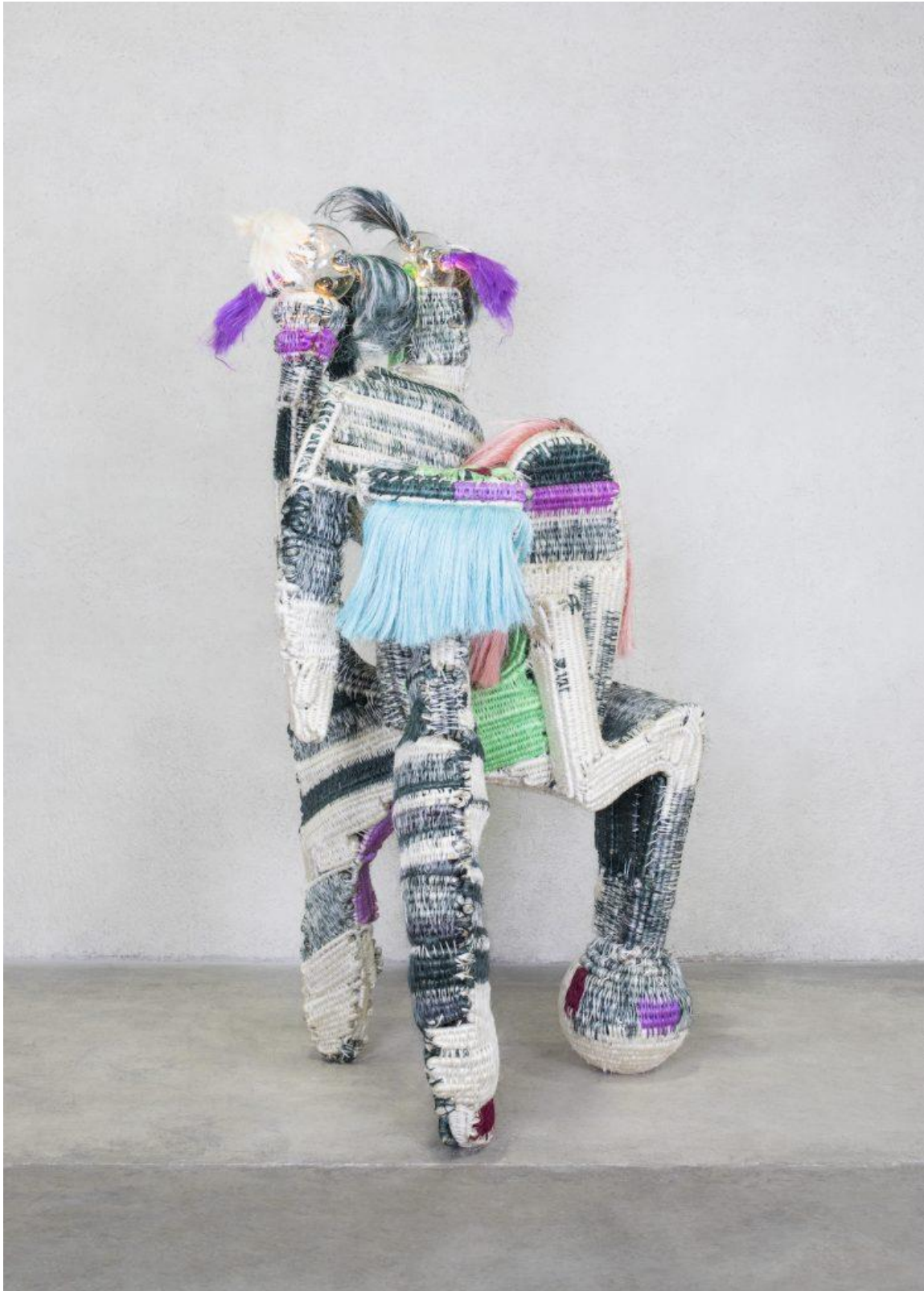
Misha Kahn [American, b. 1989] Scratchy , 2019 Hand-woven fiber, glass 89 x 48 x 40 inches 226 x 123 x 102 cm

Mechteld Jungerius, "DNA: A New Perspective on Contemporary Design," TL Magazine , February 6, 2021.