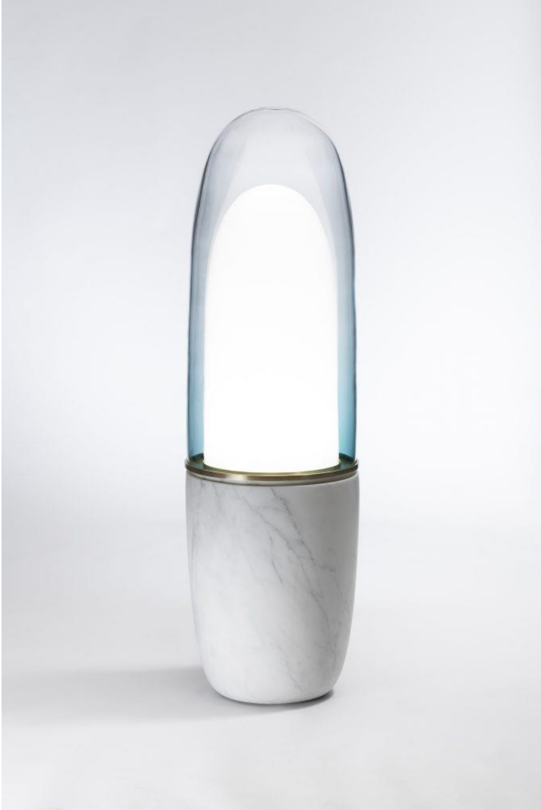
Ini Archibong [American, b. 1983] Obelisk , 2019 Marble, glass 58 x 16.75 x 16.75 inches 147.5 x 42.3 x 42.3 cm Edition of 8

Mechteld Jungerius, "DNA: A New Perspective on Contemporary Design," TL Magazine , February 6, 2021.