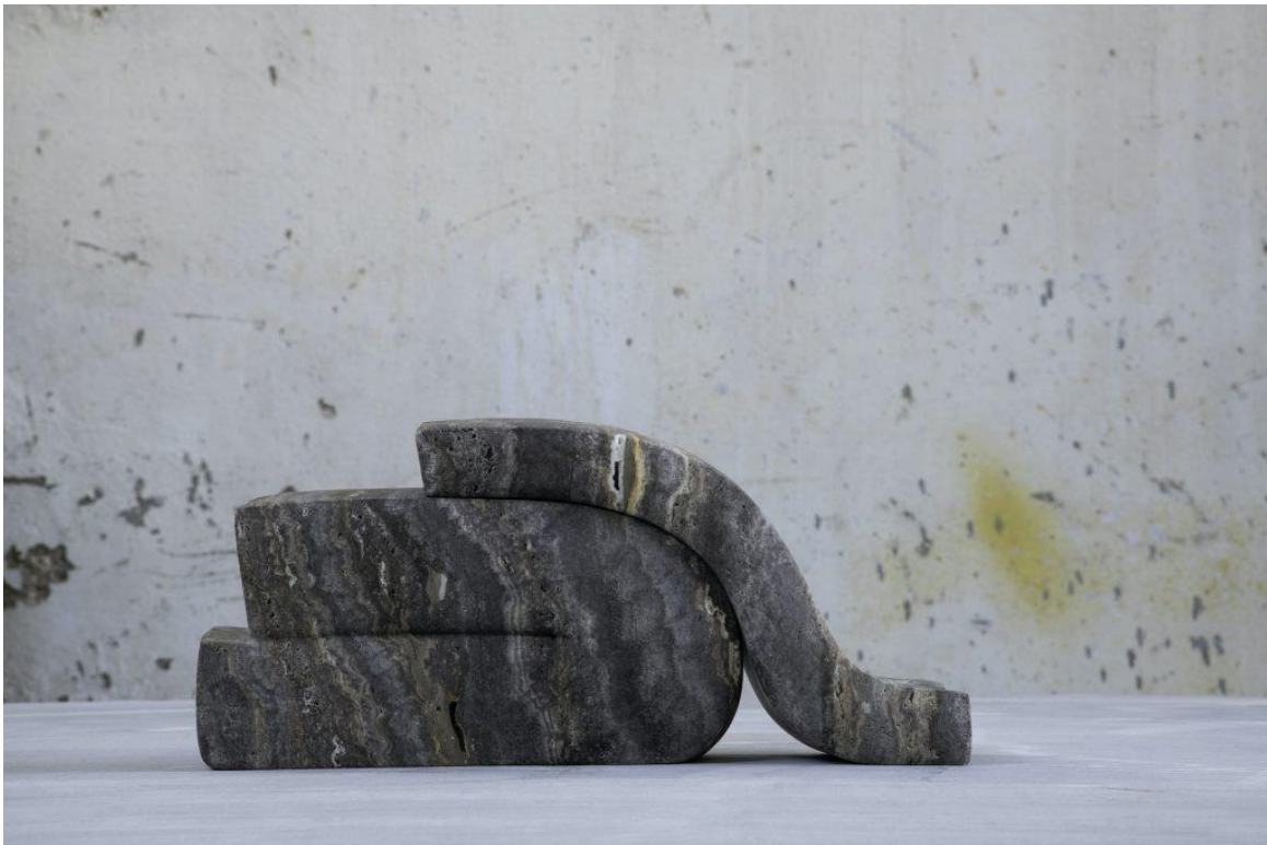
Najla El Zein [Lebanese, French b. 1983] Seduction, Pair 03 , 2019 Iranian silver travertine 7.5 x 16.5 x 5.75 inches 19 x 42 x 14.5 cm Edition of 5