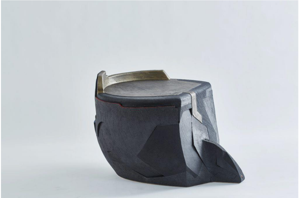
Andile Dyalvane [South African, b. 1978] Soze Nyanga (Mud Table/Stool), 2015 Black clay 19 x 30 x 23.25 inches 48.5 x 76 x 59 cm Signed: M Dyalvane 2015 Cama Gu