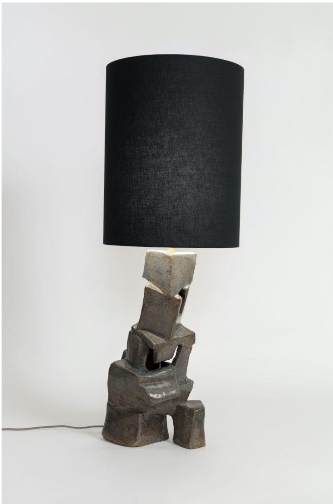
Carmen D'Apollonio [Swiss, b. 1973] Lean on Me , 2019 Ceramic, cotton shade 39.5 x 14 x 14 inches 100.3 x 35.6 x 35.6 cm

Mechteld Jungerius, "DNA: A New Perspective on Contemporary Design," TL Magazine , February 6, 2021.