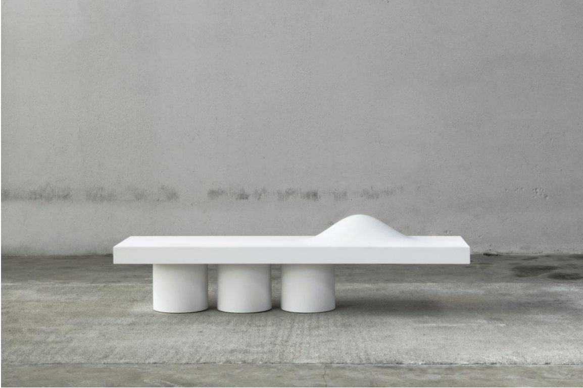
Najla El Zein [Lebanese, French b. 1983] Distortion, 10 , 2018 Fiber reinforced resin concrete 20.25 x 74.5 x 19.75 inches 51.6 x 189 x 50 cm Edition of 5 Signed and editioned on underside