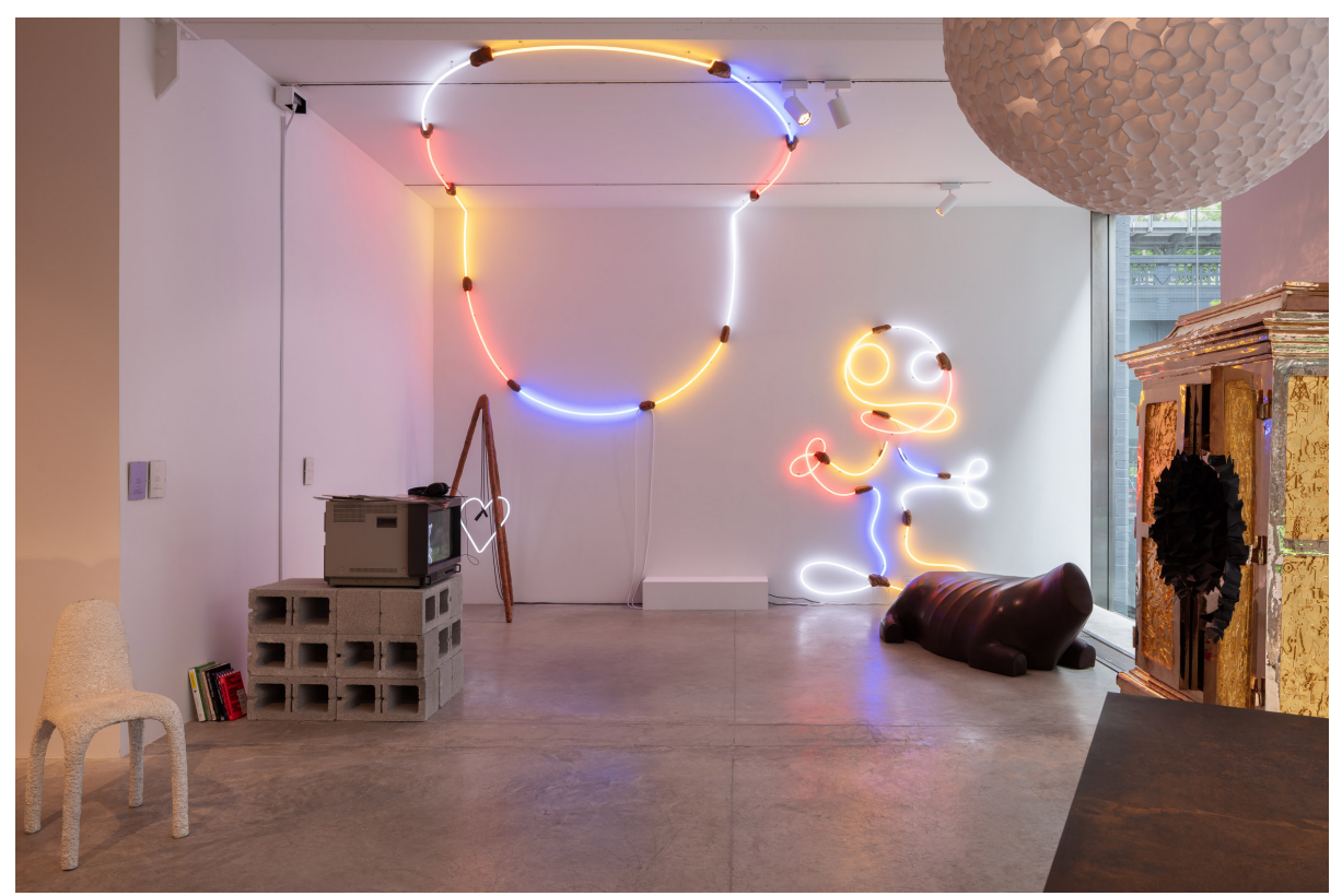
The showcase at Friedman Benda's gallery is arranged so pieces can be experienced as a collective

"When you're trying to look at a generation it's very difficult to define it, in particular Generation X," Sellers told Dezeen. "The whole point of the X was that they defied definition. So how do you frame this?"