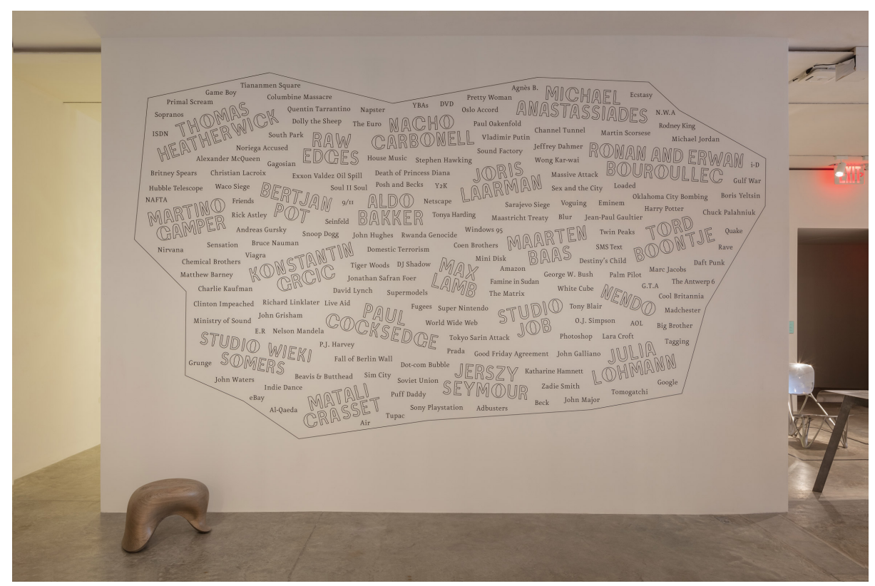
Studio Frith was enlisted to design the typeface for the exhibit

An Accelerated Culture is on show at Friedman Benda from 3 May to 8 June at 515 West 26th Street in Manhattan.