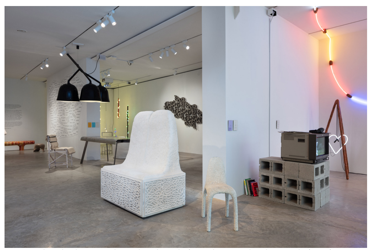
Max Lamb is displaying a plaster bench made from plaster and a chair made from foam cast in silicone bronze

Israeli duo Yael Mer and Shay Alkalay of Raw Edges are showcasing a bench made from pigmented wood block, and Bertjan Pot is showcasing gloves and masks made out of yarn and rope.