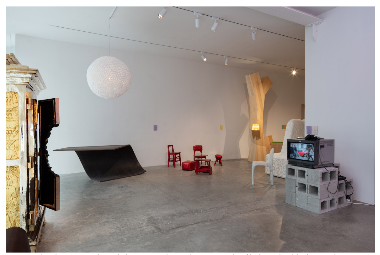
Among the designs in the exhibit are a plastic lantern and rolled steel table by Paul Cocksedge

Others featured include French designer Matali Crasset, 53, who is showcasing an abstract wooden furniture set made from lacquered birch. Dutch designer Maarten Baas, 41, is also presenting a zig zag chair made from charred wood and epoxy resin.