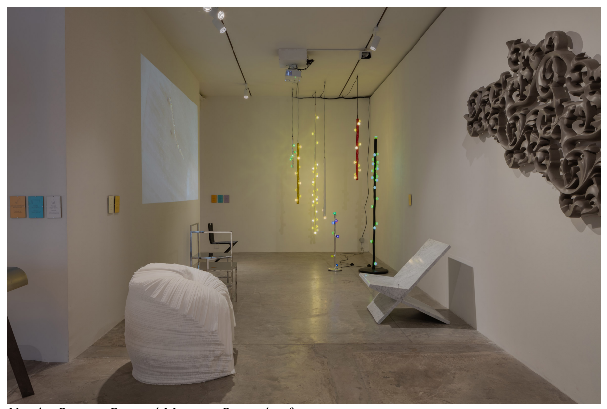
Nendo, Bertjan Pot and Maarten Baas also feature

"Everything is important to us, there was no first object or last object," she added. "We wanted everything to be a collective – that they were all feeding off this one air."