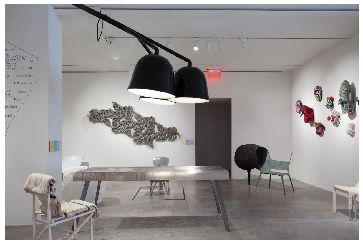
The show features many pieces of sculptural furniture

"In the mid 1990s, and early 2000s, when there was a lot more investment for young designers and particularly for European designers, the government offered grants and funds, and all sorts of support systems, exhibitions, and publications that accelerated their careers beyond that perhaps of their international peers," she said.