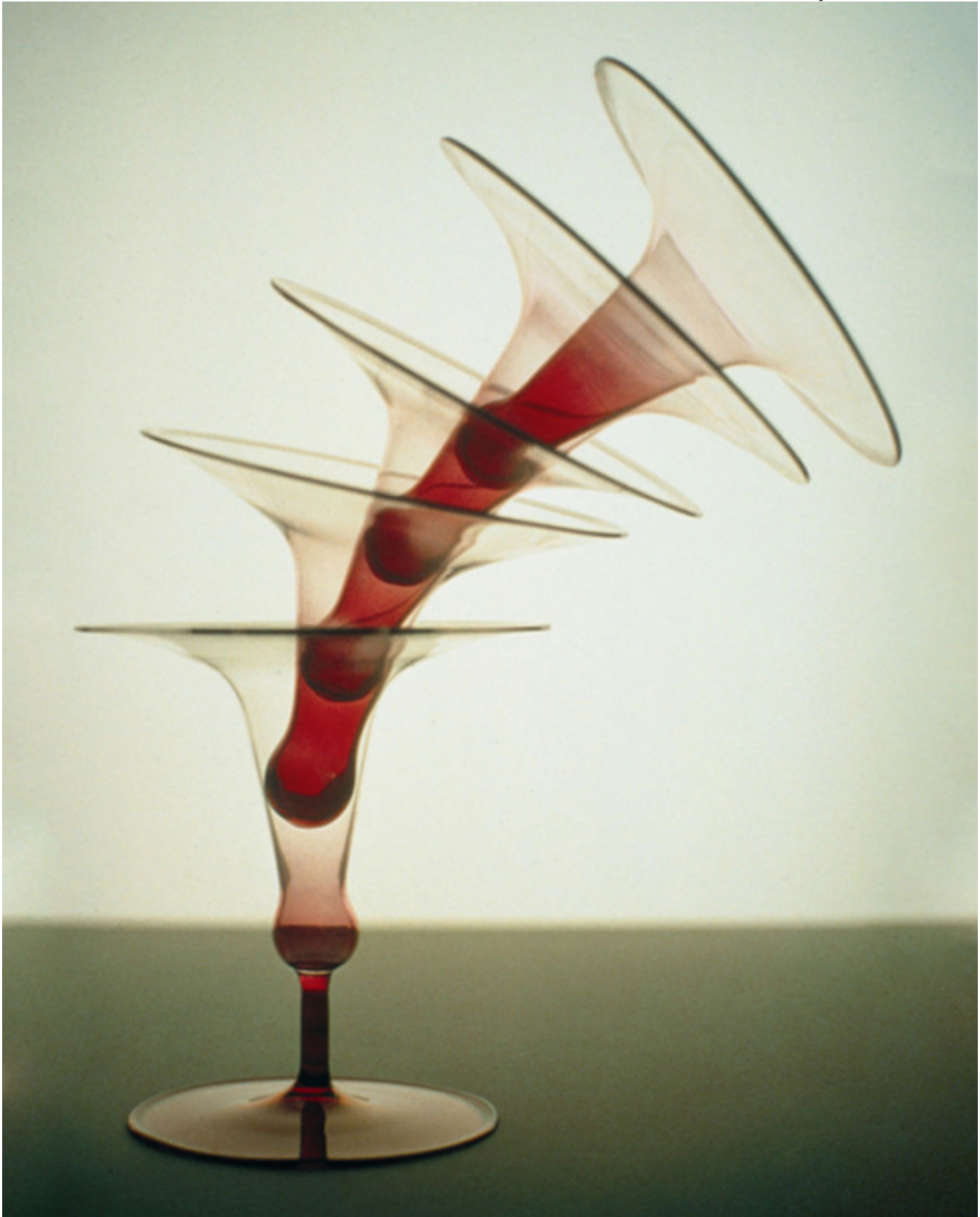
Ipomea Maculata, Collection the Bronze Age, 2000 © Design Gallery Milano, Photo Elio Basso

Collection Louis XXI, Porcelaine Humaine, 2010, Photo © Gérard Jonca / Sèvres - Cité de la céramique