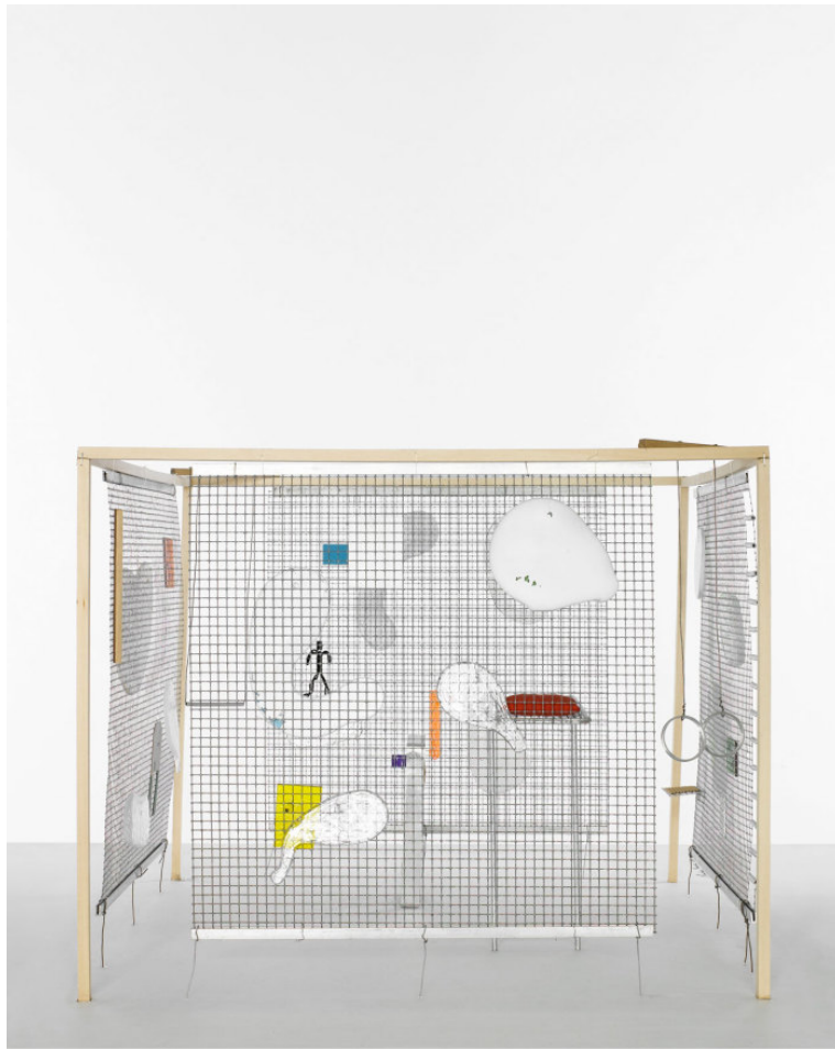
Maquette du projet Gazebo pour la Fondation Cartier, 2008

Rodewaldt, Adrienne. "Branzi in Bordeaux: The Museum of Decorative Arts & Design gives the Italian master his first institutional retrospective," L'Arco Boleno . October 1, 2014.