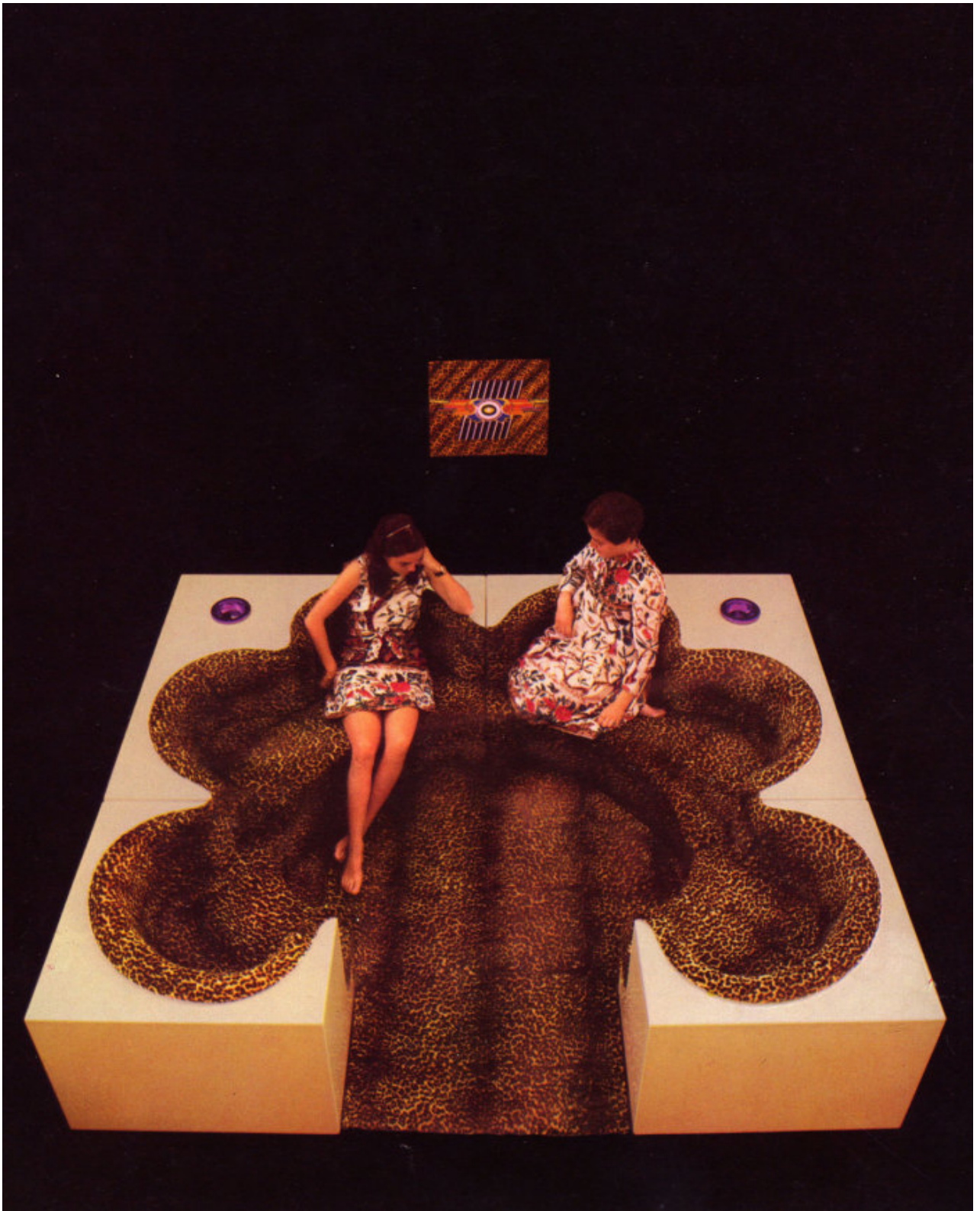
Archizoom Associati, Canapé Safari, 1967