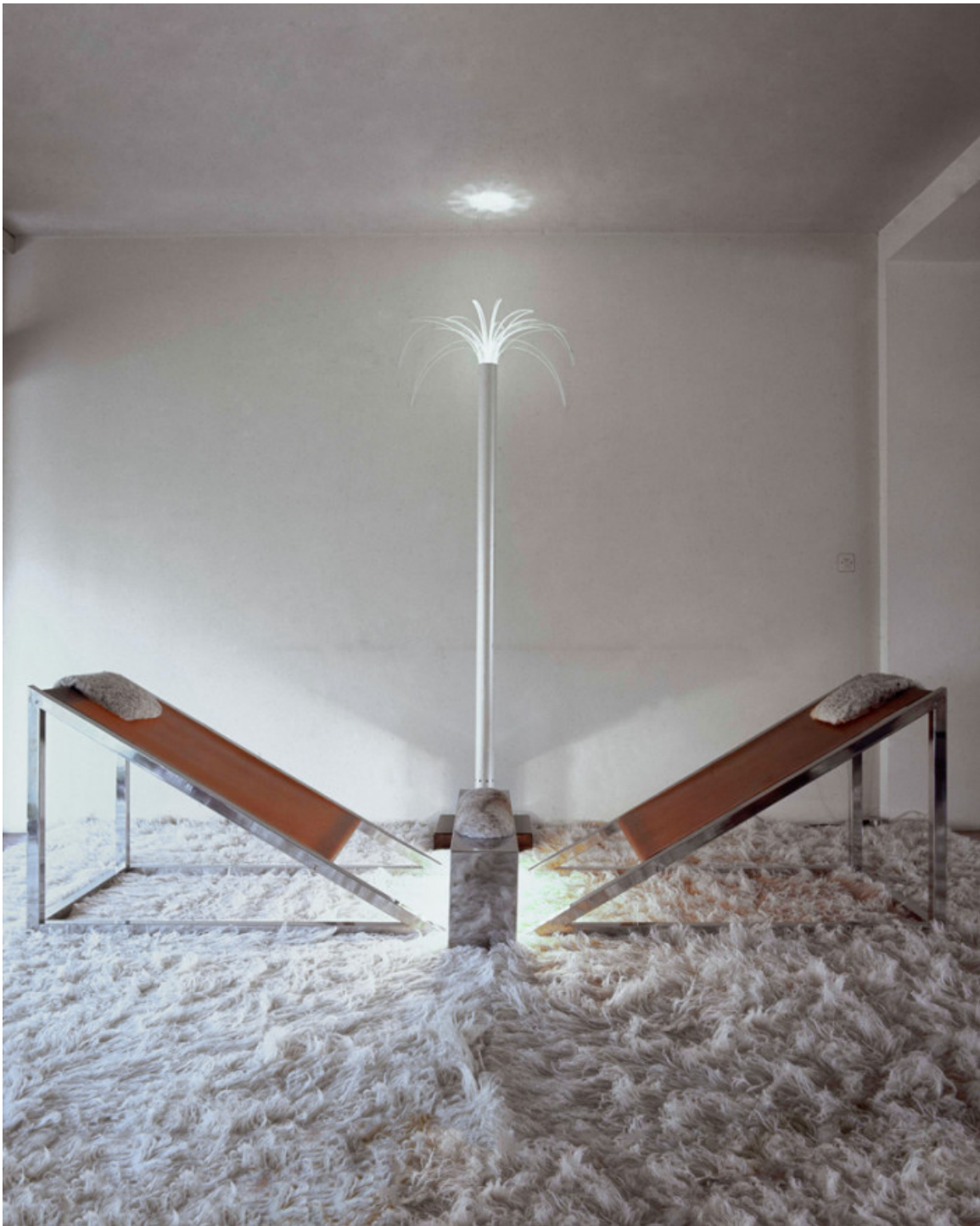
Archizoom Associati, Fauteuil-Mies, 1968