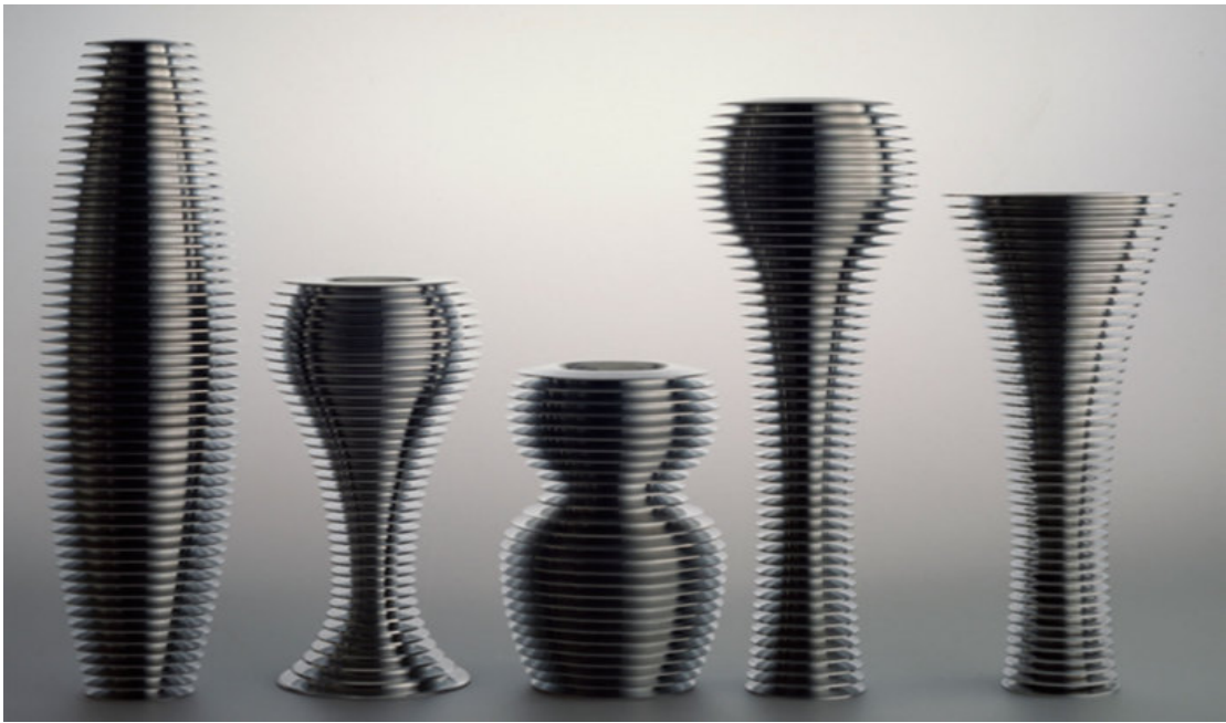
Vases Annésie, 1991 © Design Gallery Milano