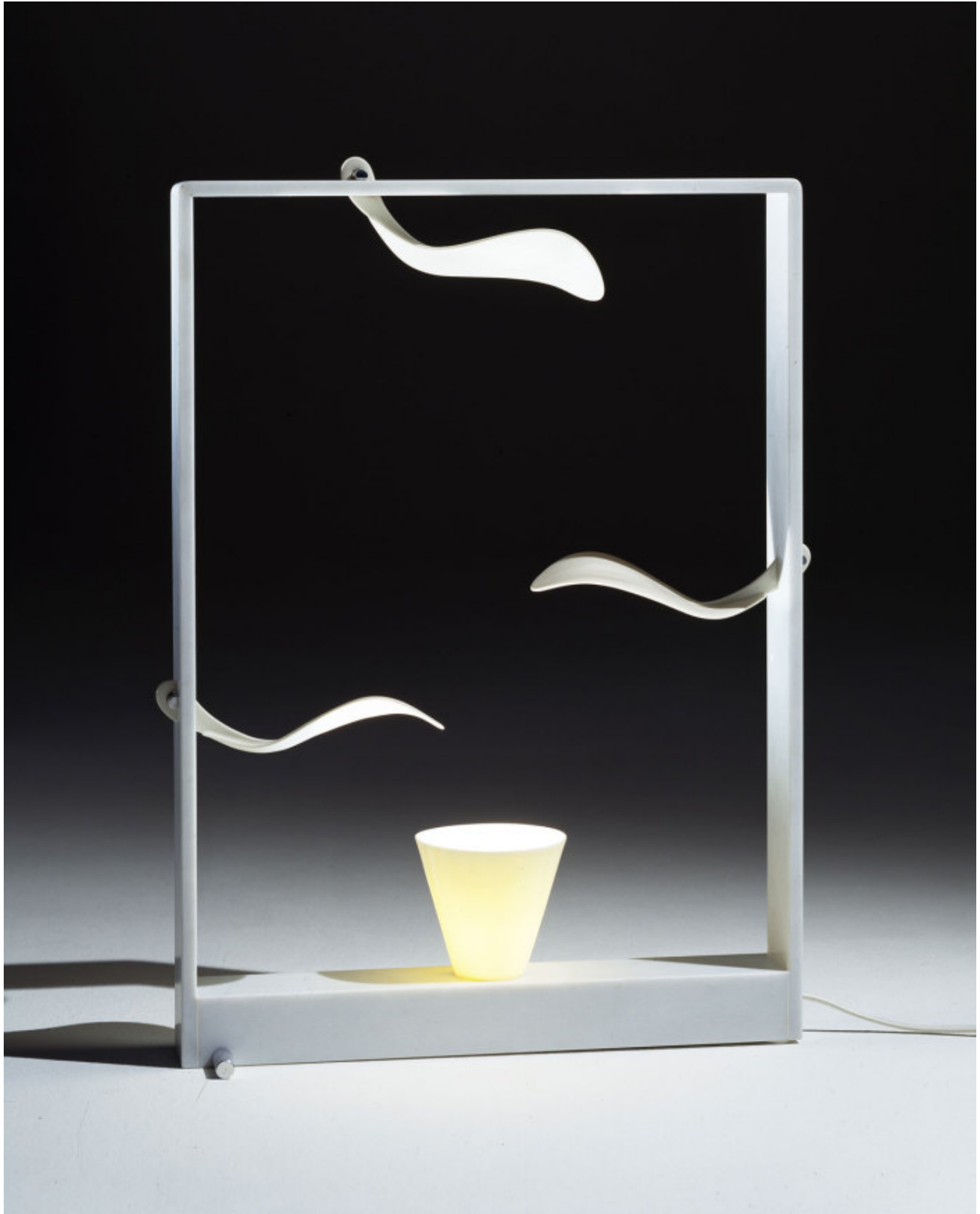
Foglia, Collection Passagi, 1998 © Design Gallery Milano, Photo Elio Basso

Rodewaldt, Adrienne. "Branzi in Bordeaux: The Museum of Decorative Arts & Design gives the Italian master his first institutional retrospective," L'Arco Boleno . October 1, 2014.