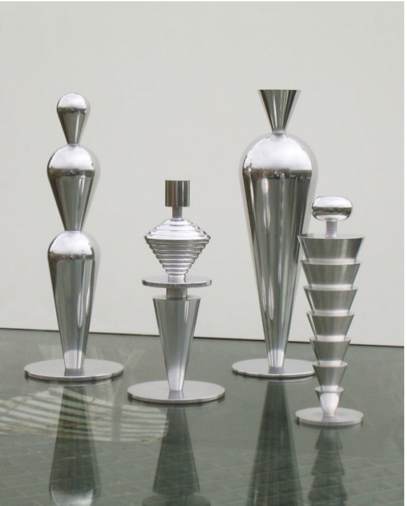
Cariatidi, 1978

Rodewaldt, Adrienne. "Branzi in Bordeaux: The Museum of Decorative Arts & Design gives the Italian master his first institutional retrospective," L'Arco Boleno . October 1, 2014.