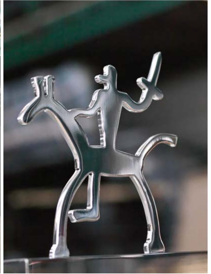
figurines images courtesy of ruy teixeira

“andrea branzi: figurine + dida at design gallery milano”, Designboom , 2011