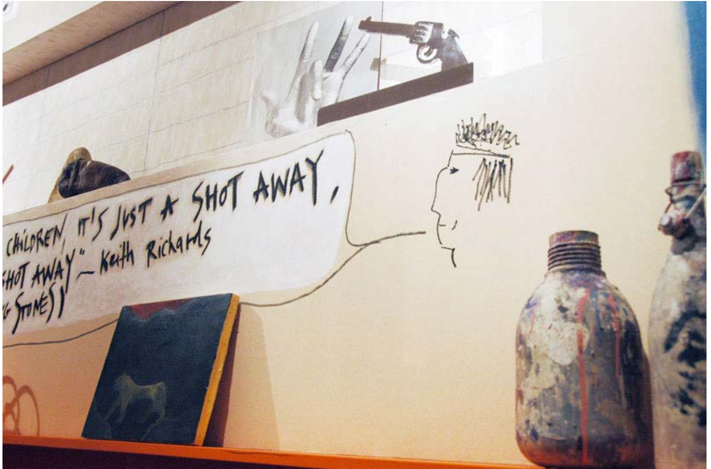
detail image

“andrea branzi: figurine + dida at design gallery milano”, Designboom , 2011