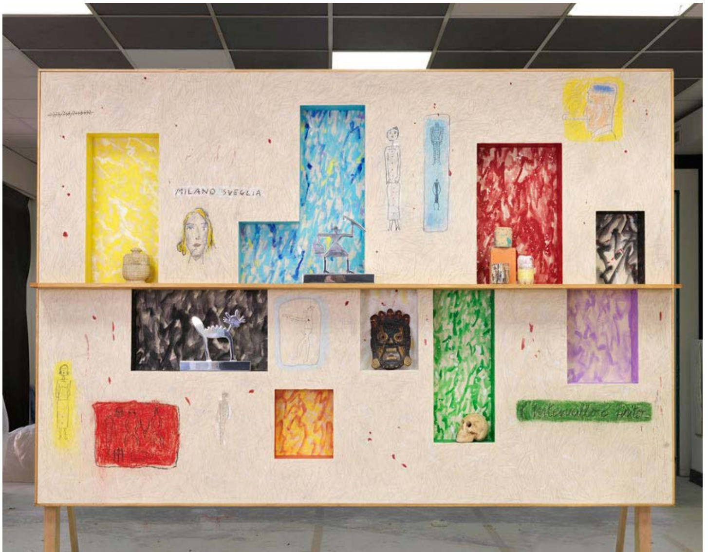
'figure 2'

"andrea branzi: figurine + dida at design gallery milano", Designboom , 2011