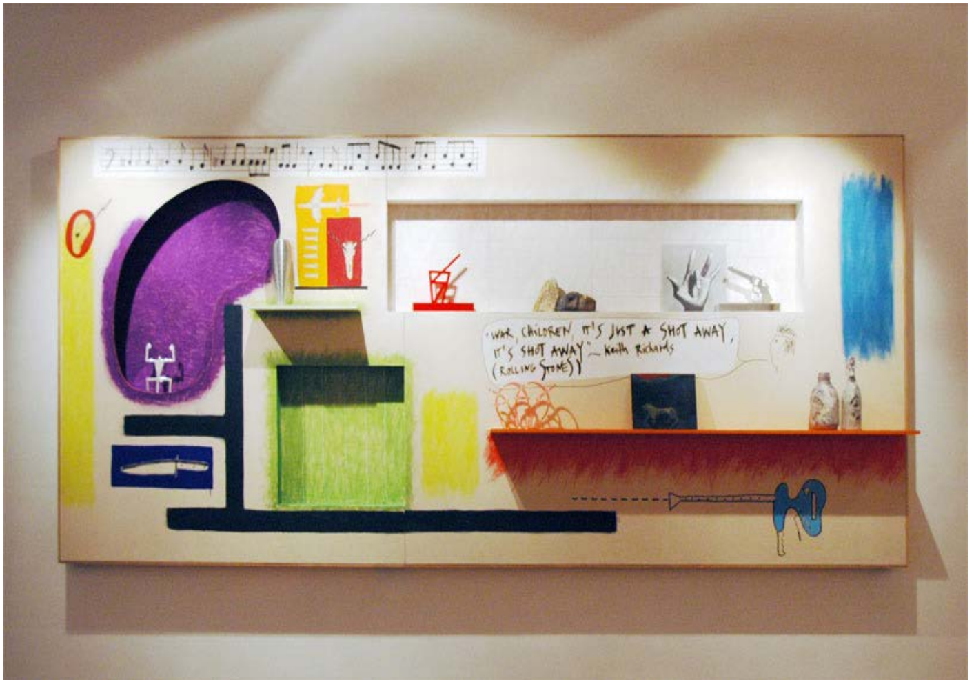
'figure 3' image © designboom

"andrea branzi: figurine + dida at design gallery milano", Designboom , 2011