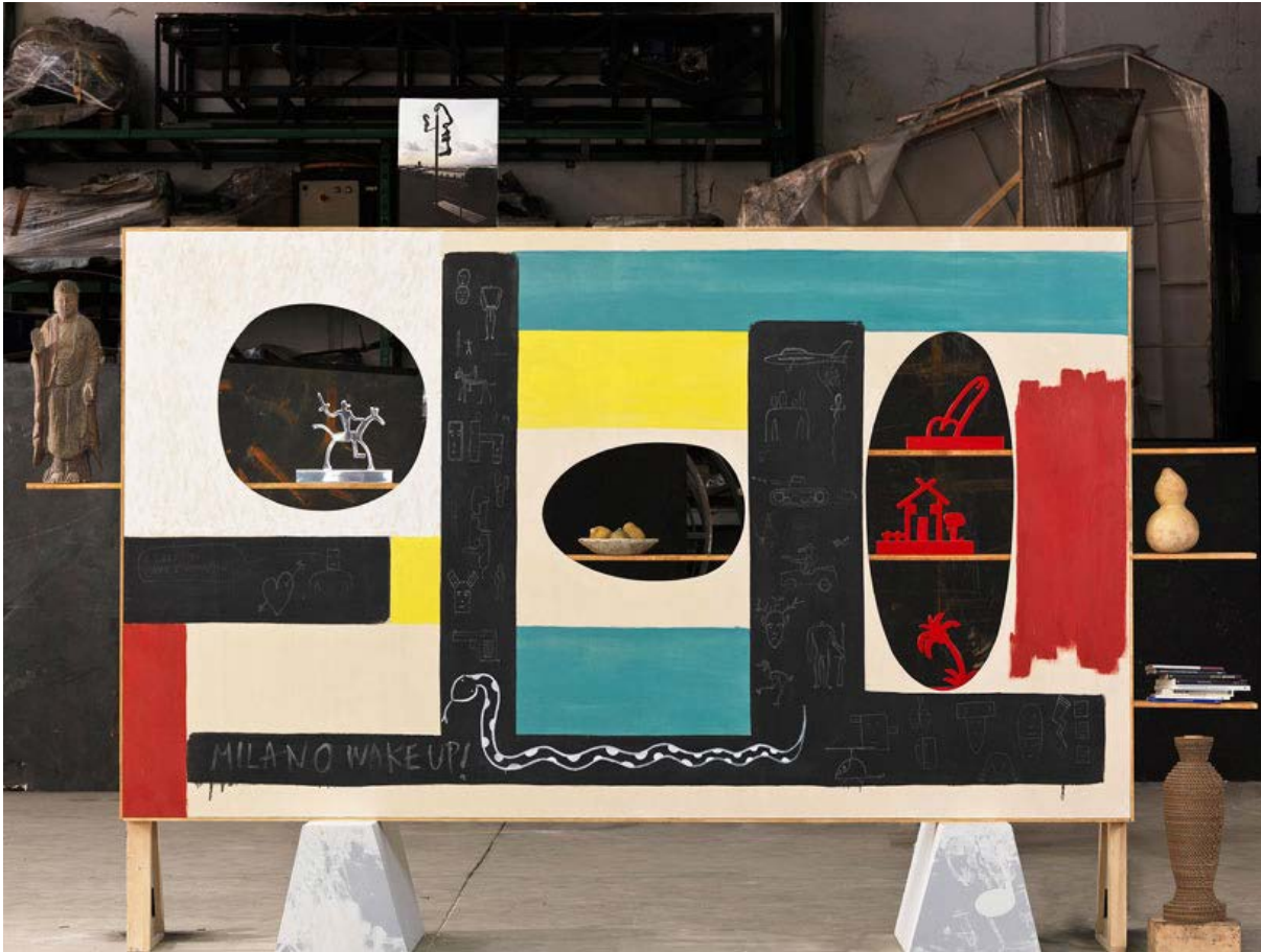
'figure 5' by andrea branzi at design gallery milano

italian architect, designer, and theorician andrea branzi is not interested in understanding the differences between design and art. instead he is interested in creating objects with narrative instilled both by him and in the stories associated with how his pieces are used by others. The 'figures' series on display at design gallery milano as part of milan design week 2011 'contaminate the unduly self-referential language of design and desecrate the untouchability of art' by creating not only a series of small hand painted sculptural forms but also a series of wall hanging paintings with shelves built into them.