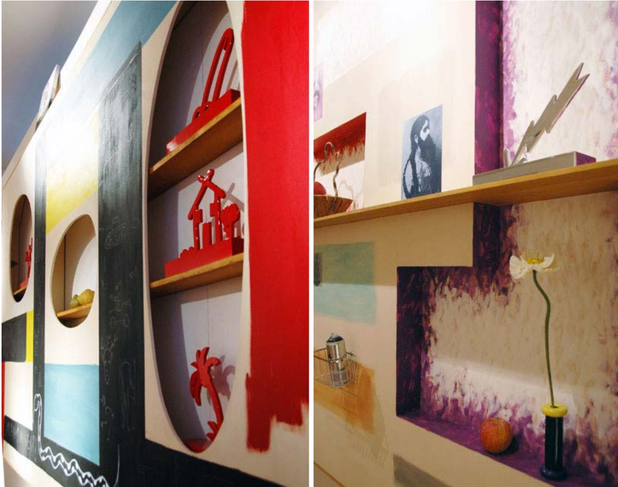
(left) detail of 'figure 5' (right) detail of 'figure 4'

“andrea branzi: figurine + dida at design gallery milano”, Designboom , 2011