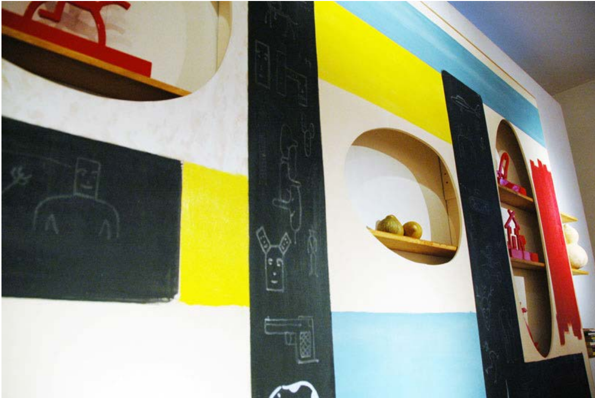
figure 5' image © designboom

these forms, and their presentation, cross long established borders between art and design and the traditional conceptions that seem to arise when the two are crossed. the pieces, made from mixed media, oil paints, cast and enameled solid aluminum, interact with each other and the viewer by allowing for the pieces to be moved and changed while standing in their presence. dramatically improving the compositions by simply moving a few objects around on the same canvas, branzi has created a dynamic system that produces seemingly finished traditional art pieces with a shelf life at the whim of the viewer.