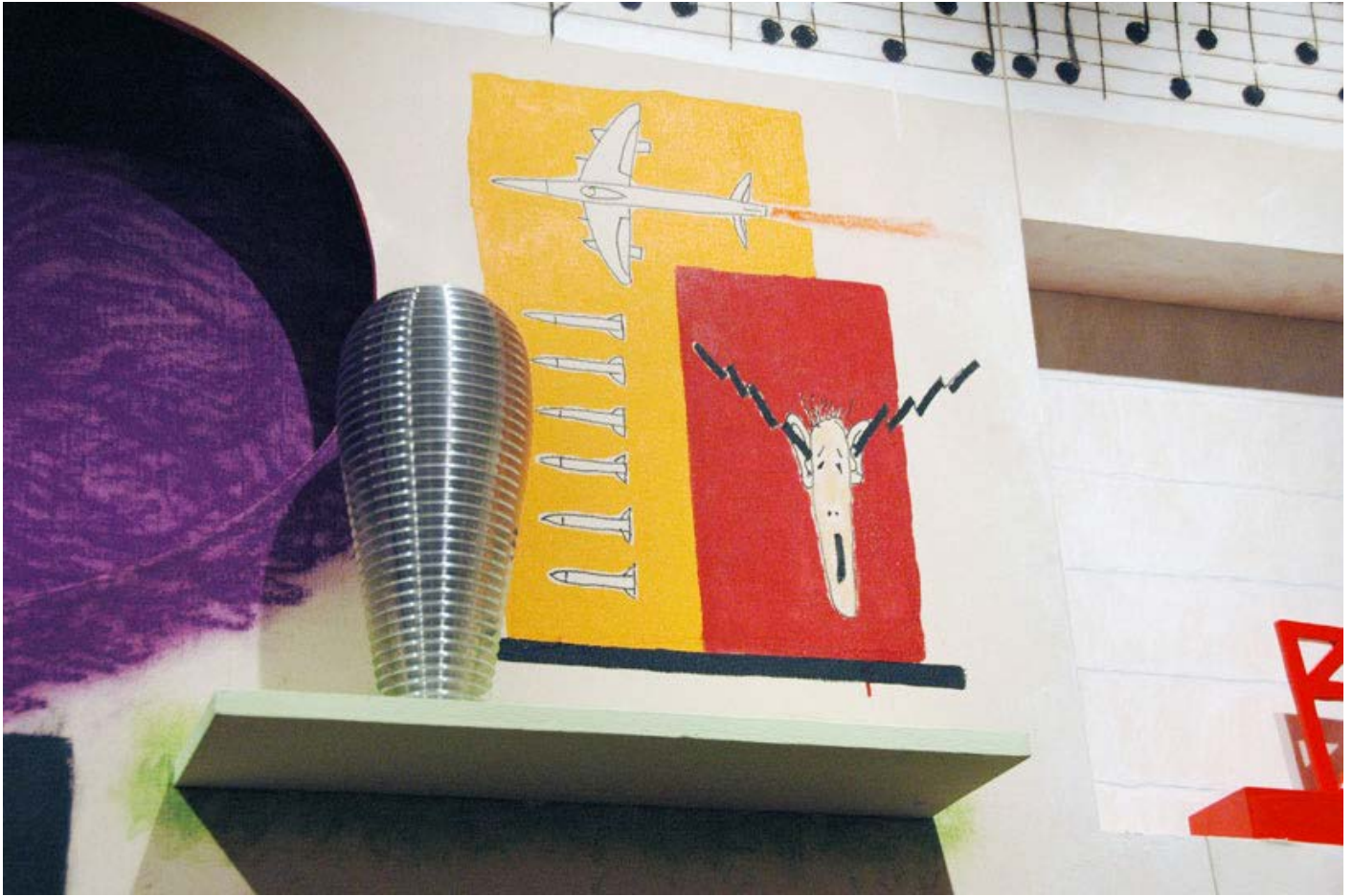
detail of 'figure 3' image

"andrea branzi: figurine + dida at design gallery milano", Designboom , 2011