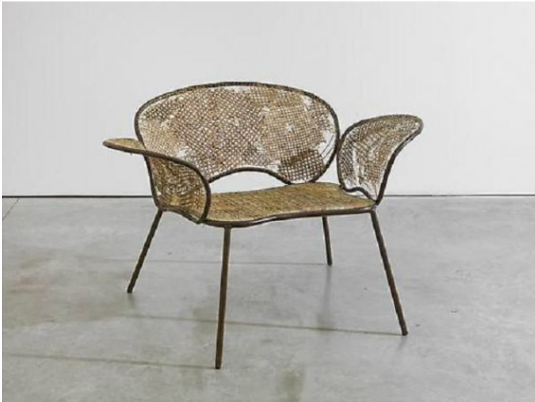
Campana Brothers, Detonado Chair, 2013, Natural wicker fiber, covering stainless steel structure, Edition of 8

5 June - 3 July 2013 at Friedman Benda Gallery, New York.