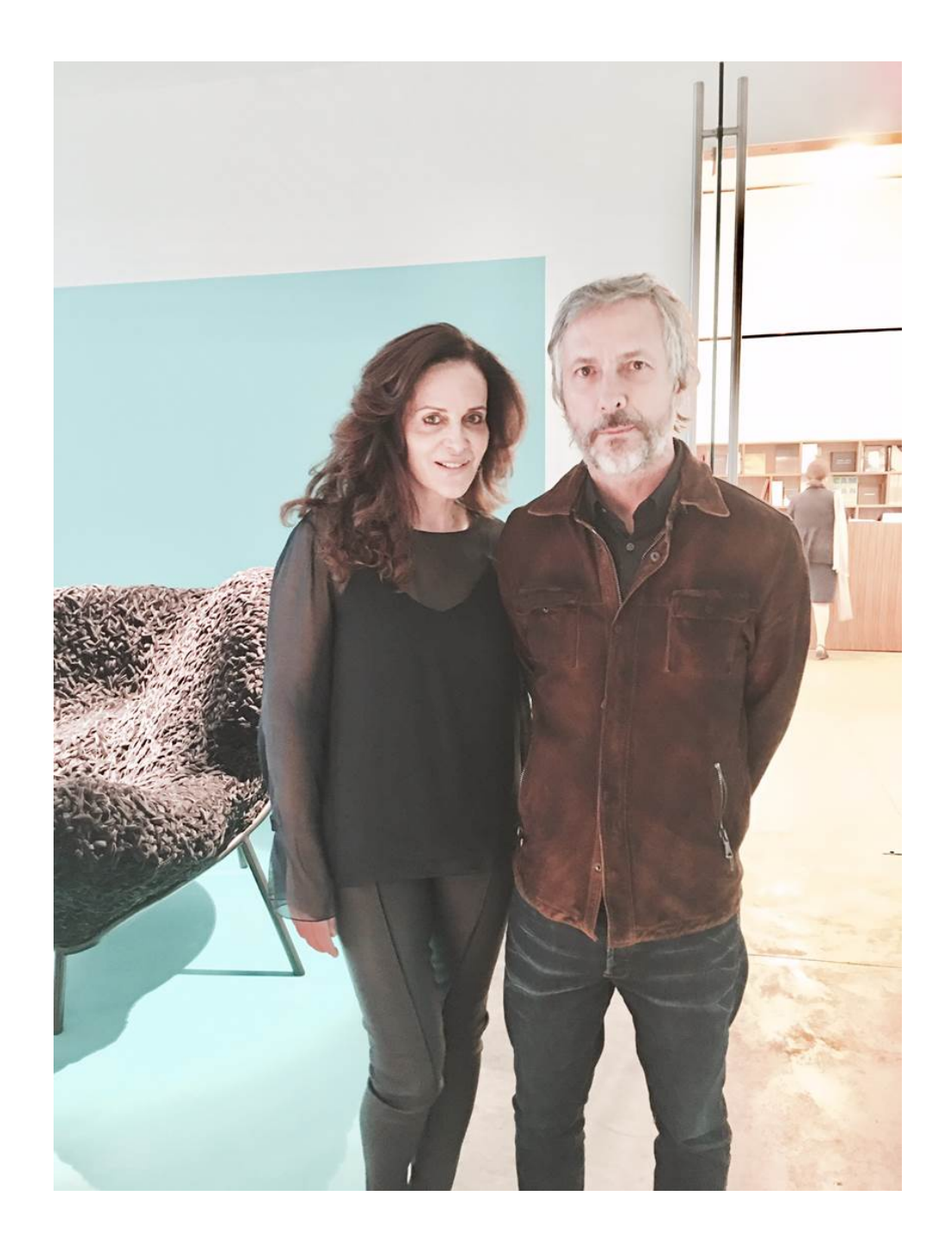
Ohad, Daniella. "Hybridism by the Campana Brothers," Daniellaondesign.com , September 7, 2017.

gallery space, dozens of animals, all cast in aluminum, iron, and bronze, all are stuck one with the other, look as if they are floating on the eternal water. You can view the objects in various layers, and this is what I found mostly intriguing about this exhibition. They can be viewed as functional objects, sofas, benches, candlesticks. But the can also be viewed as baroque sculptures, or as works of art that carry powerful and challenging narratives. Or they can be seen as the combination of all, which was my own take. The exhibition closes down on October 14.