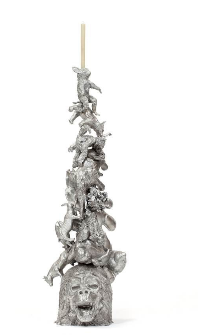
Ohad, Daniella. "Hybridism by the Campana Brothers," Daniellaondesign.com, September 7, 2017. FRIEDMAN BENDA 515 W 26TH STREET NEW YORK NY 10001

FRIEDMANBENDA.COM TELEPHONE 212 239 8700 FAX 212 239 8760