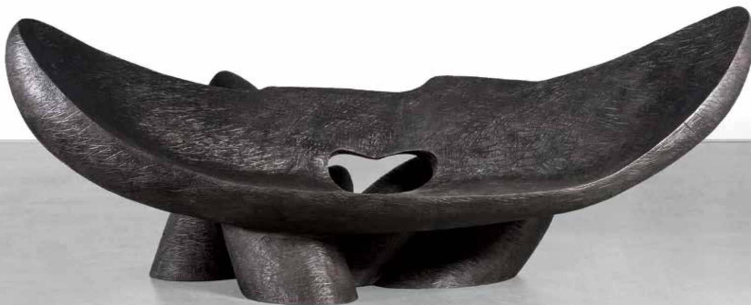
ADRIEN MILLOT, WENDELL CASTLE, AND FRIEDMAN BENDA

Temptation , 2014. Bronze, 42¼ x 101 x 50½ in.