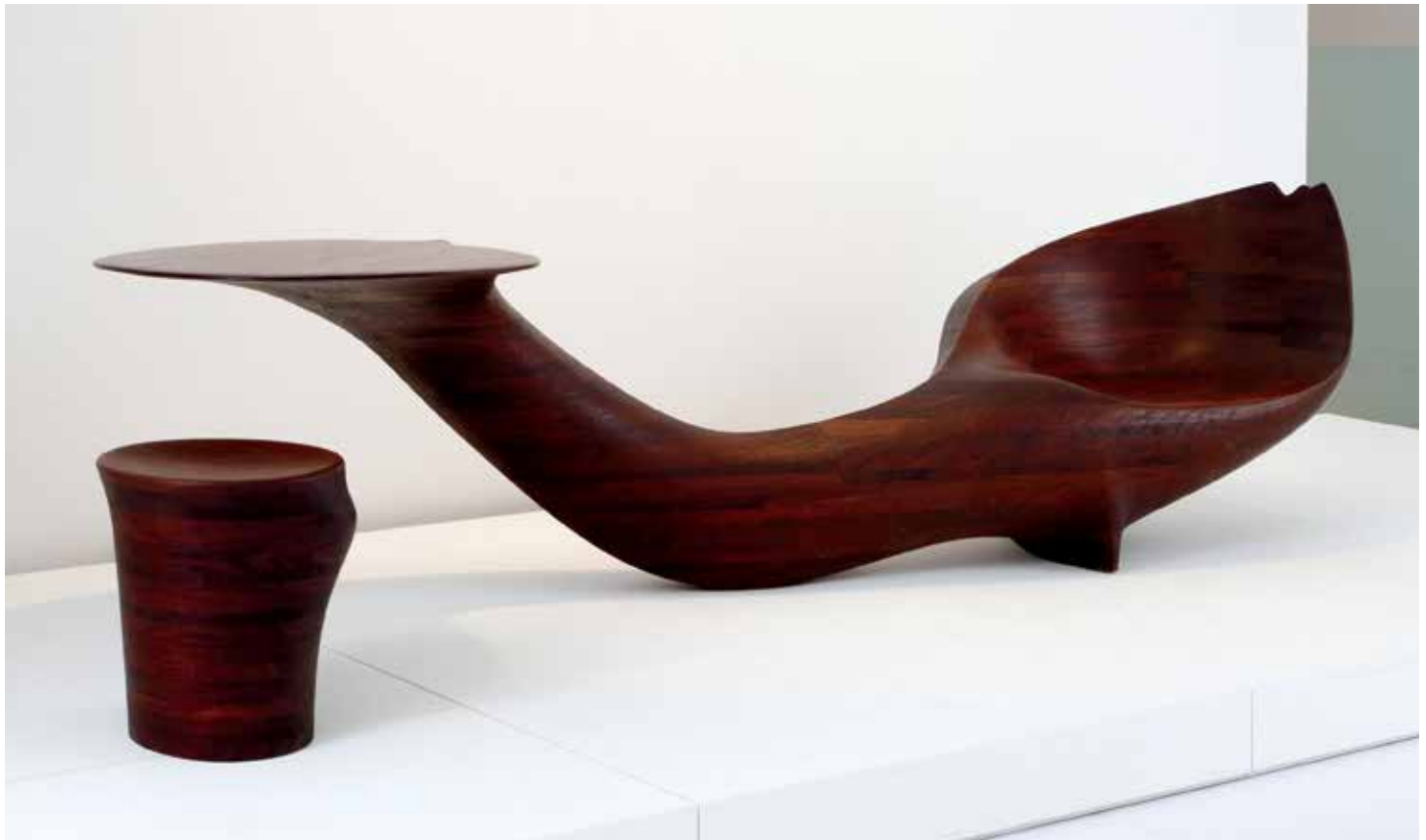
Table-Chair-Stool, 1968. Afrosia, other African hardwoods, and adhesive. Table-chair: 26 3/4 x 115 3/4 x 35 in. Stool: 17 x 16 1/4 x 15 in.

Slenske, Michael. "The Rebel and the Robot," Modern Painters , October 2015.