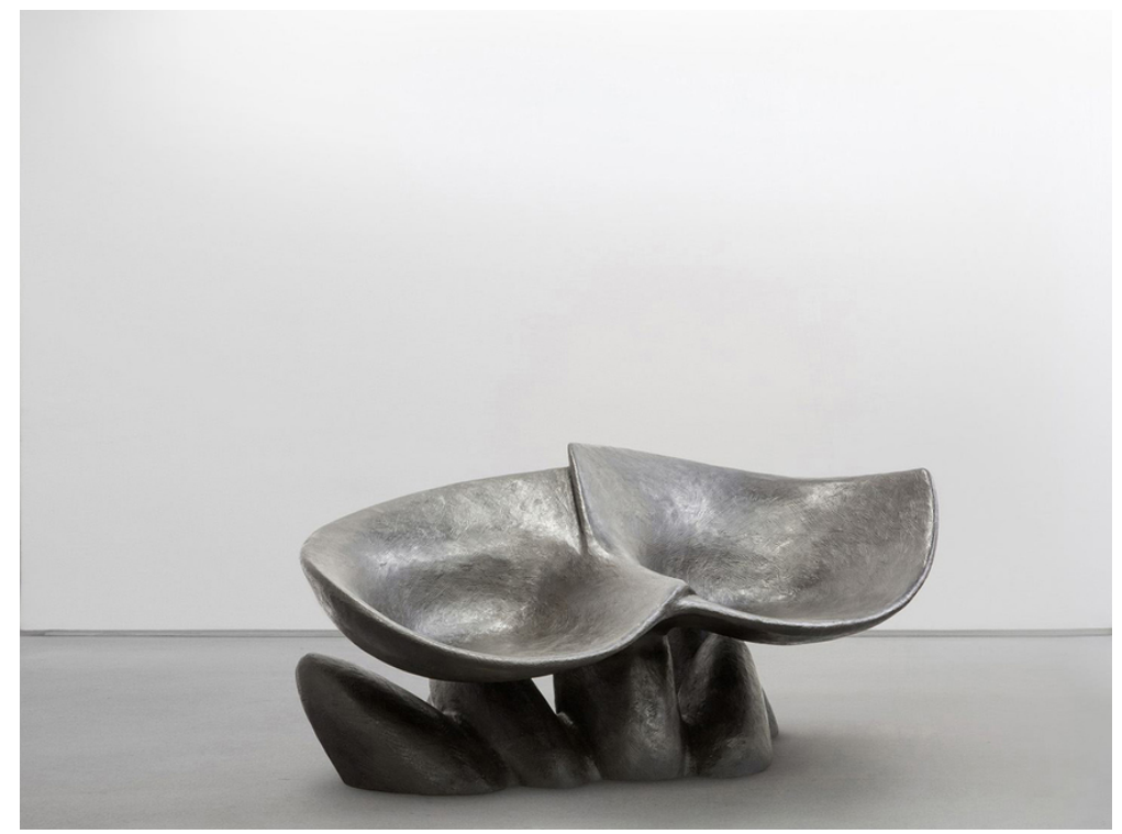
Wendell Castle, Impulse Gatherer, 2013, Bronze, 31.5 x 68.9 x 42.13 inches. Edition of 8. Courtesy of Wendell Castle and Friedman Benda. Photography: Adrien Millot

13 – 17 May 2015 at Skylight Clarkson Sq in New York, United States