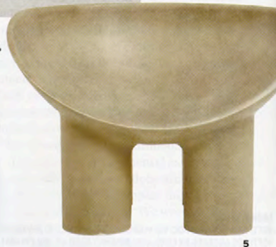
4. THE PLAY TAPESTRY, WHICH IS BASED ON CHILDREN’S BUILDING BLOCKS. 5. THE SQUAT ROLY-POLY CHAIR—SHOWN HERE IN FIBERGLASS—WILL BE CAST IN SOLID GLASS FOR ASSEMBLAGE 5.