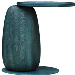
EOS table for Sé.

hewn wood appears as pebble-shaped tables and high-back seats. Says Archibong, “Everything feels more grounded, more lasting, less likely to float away.”