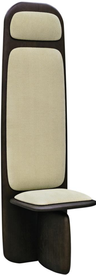
Atlas chair for Sé.