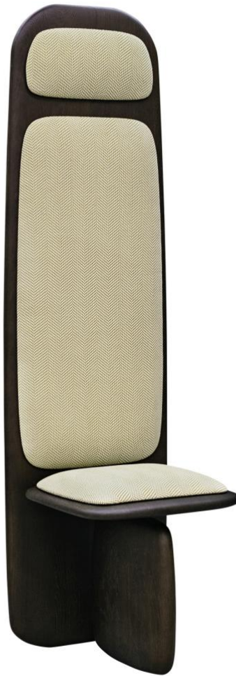
Atlas chair for Sé.