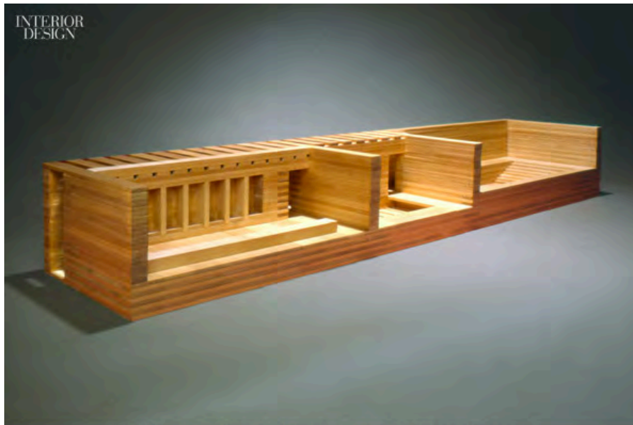
ONLINE EXCLUSIVE. Yellow Pool House by Jackie Ferrara in stained basswood.