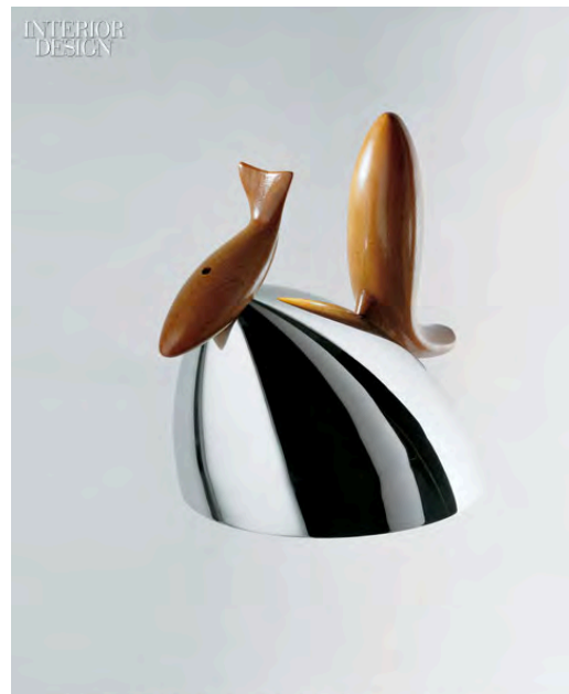
ONLINE EXCLUSIVE. Frank Gehry's Pto kettle for Alessi.