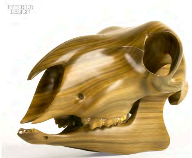
Laurel Roth's Food #3-Sheep in vera wood, gold leaf, and Swarovski crystal.