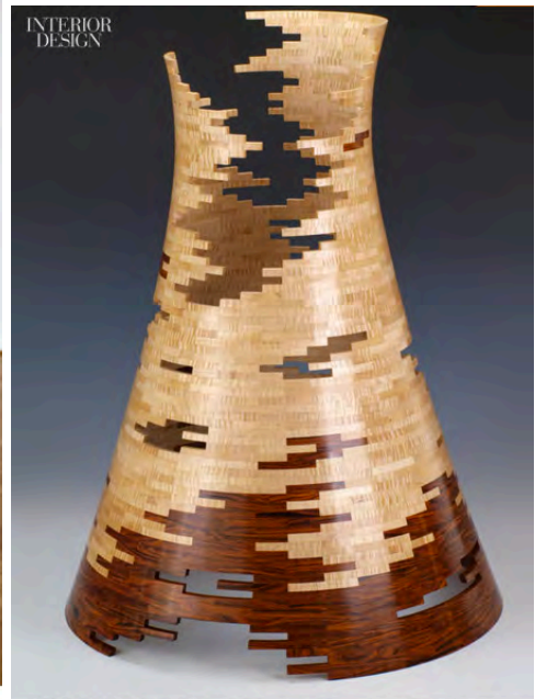
ONLINE EXCLUSIVE. Bud Latven's Tower 9 in Panamanian cocobolo and tiger maple wood.