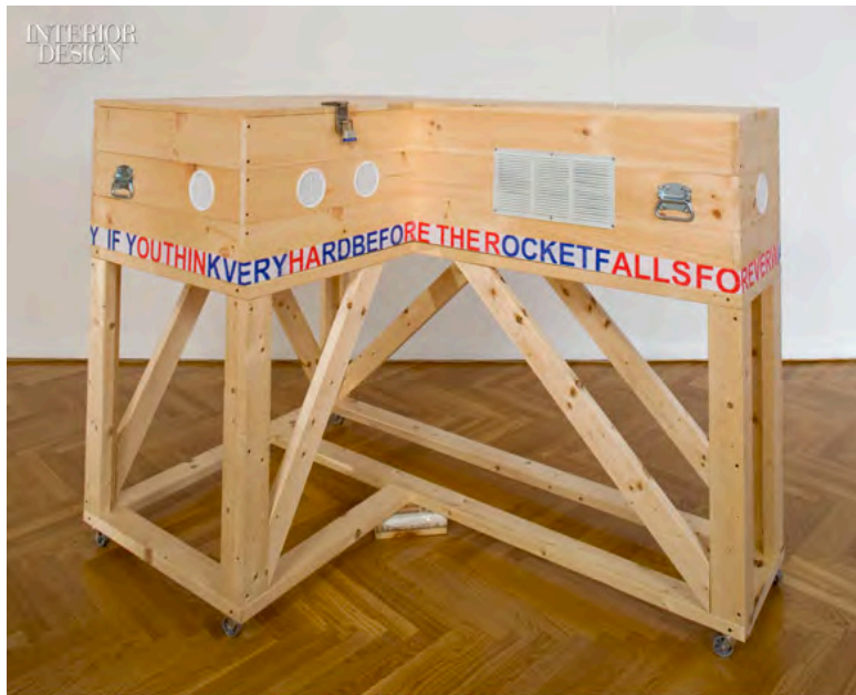
ONLINE EXCLUSIVE. William Pope.L's Coffin (Flag Box), 2008.