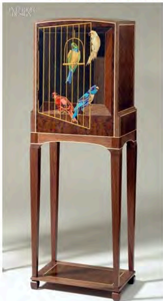
ONLINE EXCLUSIVE. Parrots, in wood, brass, mother-of-pearl, and stone, by Silas Kopf.