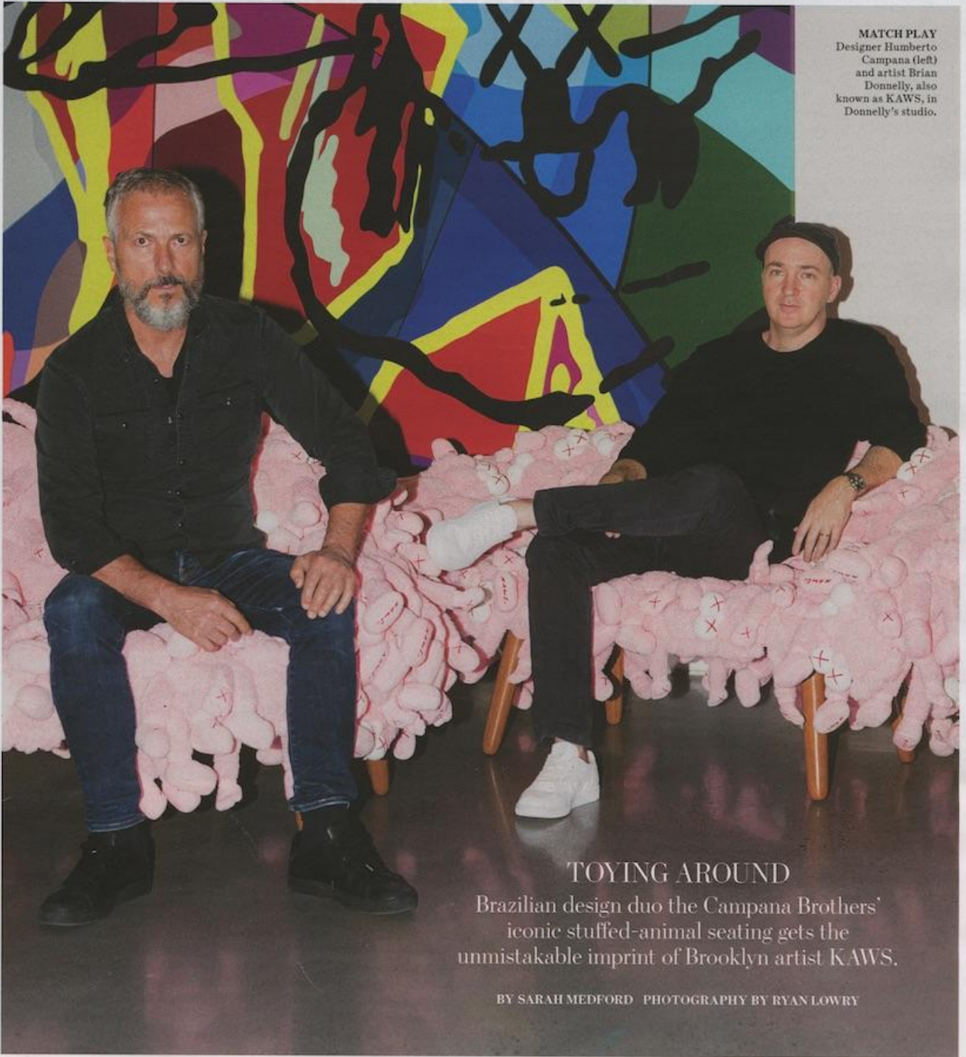
MATCH PLAY Designer Humberto Campana (left) and artist Brian Donnelly, also known as KAWS, in Donnelly's studio.