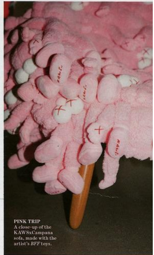
PINK TRIP A close-up of the KAWSxCampana sofa, made with the artist's BFF toys.