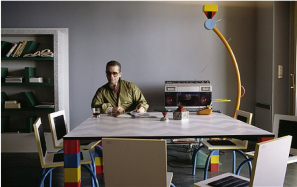
Karl Lagerfeld in his Memphis-furnished Monte Carlo apartment, 1981.

Finally, our last section 'Money' examines the rise of corporate postmodernism and the reflection of artists and designers on the commodity status of their own work. As the '80s wore on and the world economy boomed, postmodernism became the preferred style of consumerism and corporate culture. Japan entered the years of the so-called 'bubble economy,' allowing architects such as Philippe Starck to realise trophy-like buildings. In Europe and America, 'design editing' firms like Alessi and Swid Powell turned the name brand value of architects to the selling of luxury silver and designer tableware.