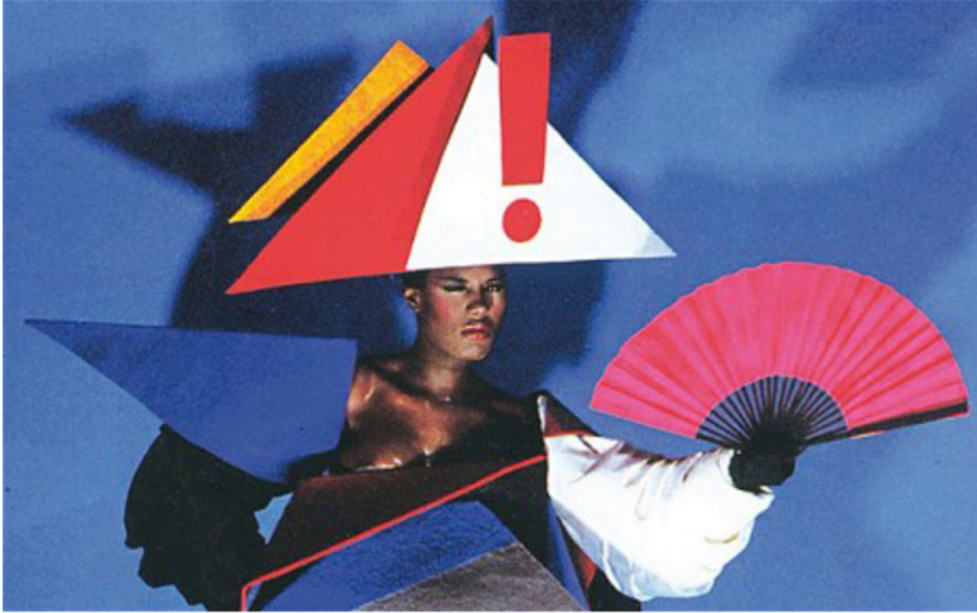
Grace Jones maternity dress, 1979. An image from Postmodernism at the V&A

Postmodernism's co-curator gives his essential guide to this exceptional exhibition