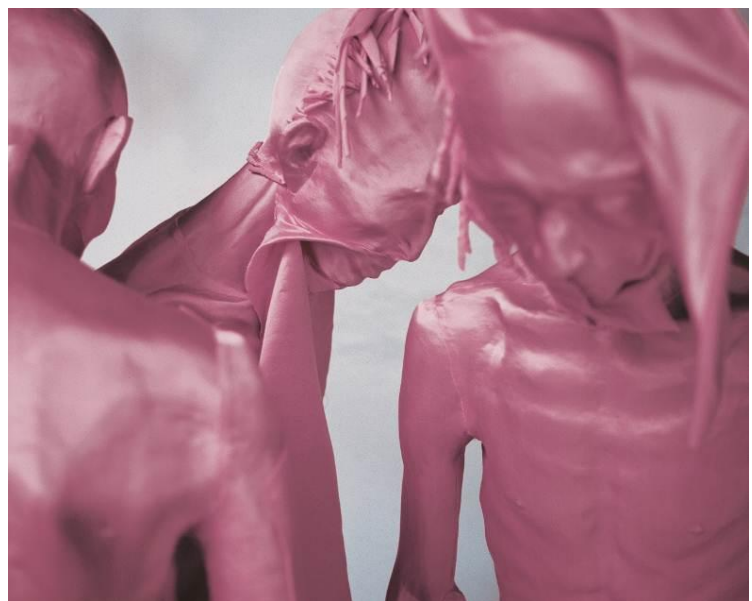
Endless (detail) , 2004. Fiberglass, silk, mixed media. Dimensions variable. "Non Zero," Beijing Tokyo Art Project, 2004. Collection of the artist.