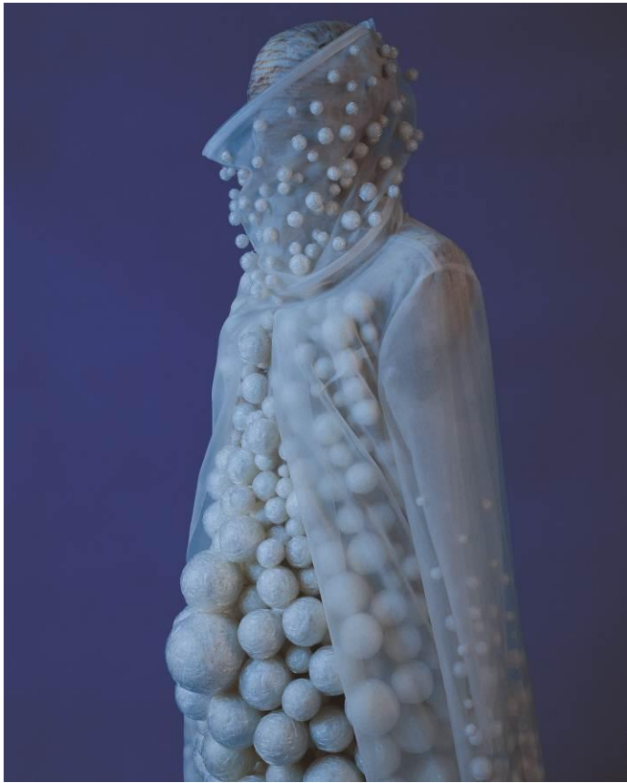
Here? Or There?(detail) , 2002. Fiberglass, fabric, thread, mixed media. Dimensions variable. Collection of the artist.

and thread winding techniques. These portraits— including her self-portrait, which is on view in the exhibition— evolved into full figure images, then into an installation of three dimensional figures created for the Shanghai Biennale in 2002. Here? Or There? , which is also on view in the exhibition, comprises nine figures and six video projections. The figures are dressed in manifestations of all of Lin's embroidery and thread winding techniques.