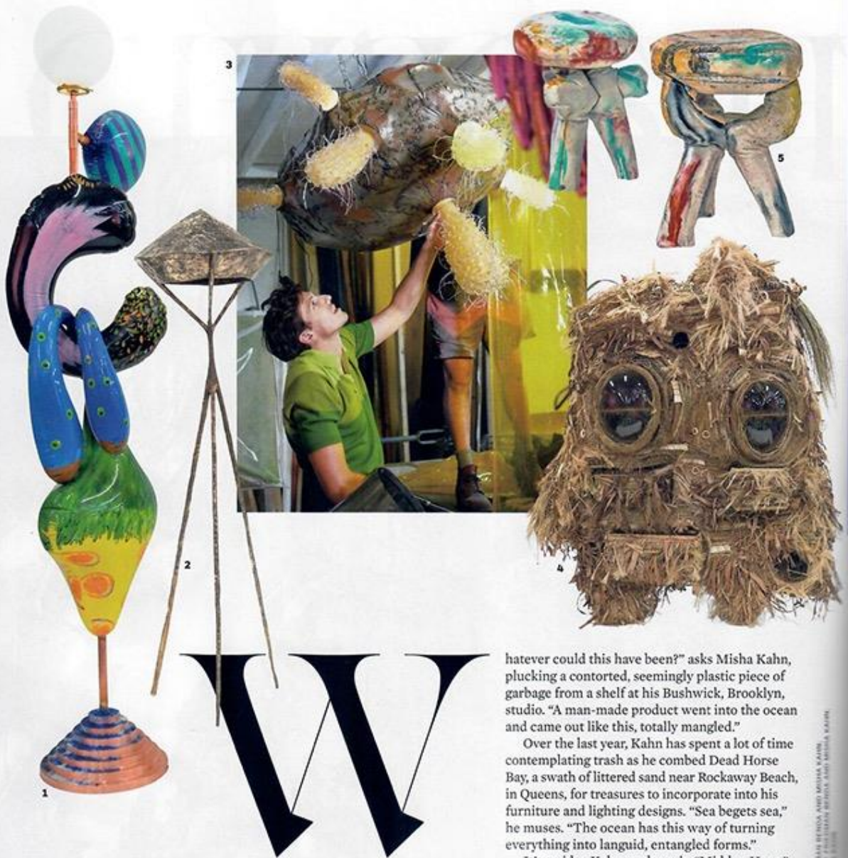
1. KAHN'S RESIN-AND-COPPER SENTINEL OF INEVITABILITY LAMP. 2. A BRONZE FLOOR LAMP. 3. KAHN SCREWS A BLOWN-GLASS SHADE COVERED IN OSTRICH FEATHERS INTO A STEEL LIGHT FIXTURE. 4. THE WILD ONE CHINA CABINET WAS WOVEN FROM BANANA LEAVES, CACTUS, BONE, WOOD, GRASS, AND GLASS BY ARTISANS IN SWAZILAND. 5. CONCRETE STOOLS.