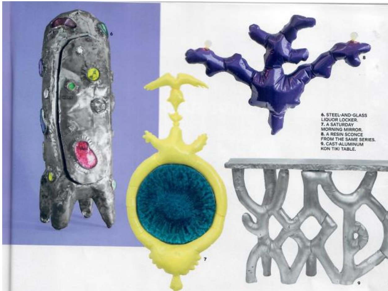
6. STEEL-AND-GLASS LIQUOR LOCKER. 7. A SATURDAY MORNING MIRROR. 8. A RESIN SCONE FROM THE SAME SERIES. 9. CAST-ALUMINUM KON TIKI TABLE.