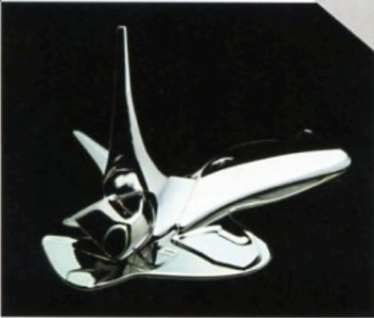
Left: This silver coffee and tea service by world-renowned London-based architect and designer Zaha Hadid for Alessi mirrors her signature design in its fluid, revolutionary form. "Designing products is of great importance to us," she says. "The pieces are experimental, quicker to execute than the architecture projects and inspire creativity. We see it as part of a continuous process of design investigation." The coffeepot is the central sleek tower and is nested underneath the teapot, a flat organically-shaped piece. The two smaller pieces hold milk and sugar.