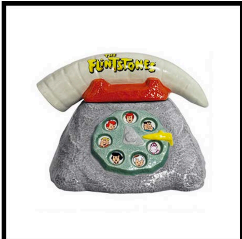
Piece I wish I'd made: "Flintstones phone / cookie jar."