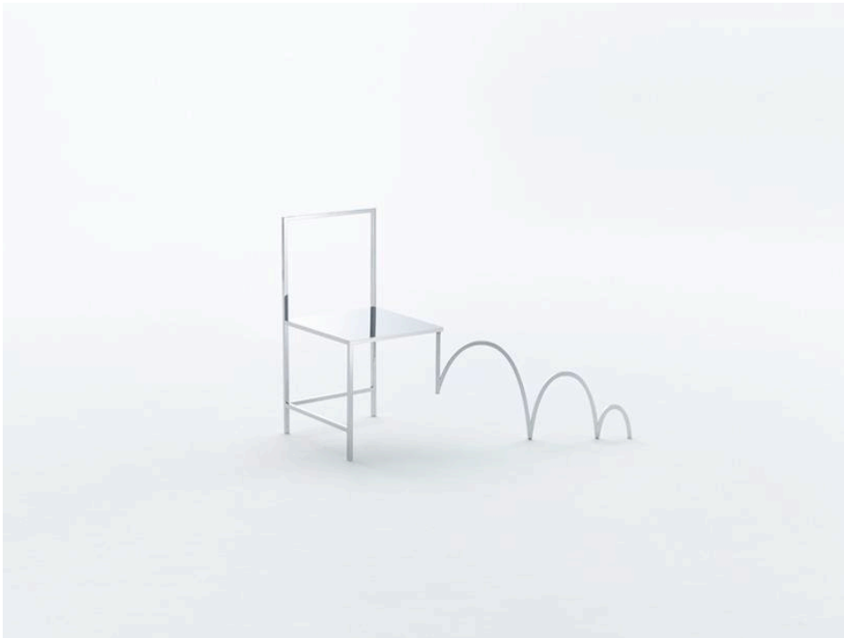
each individual piece takes on a playful energy