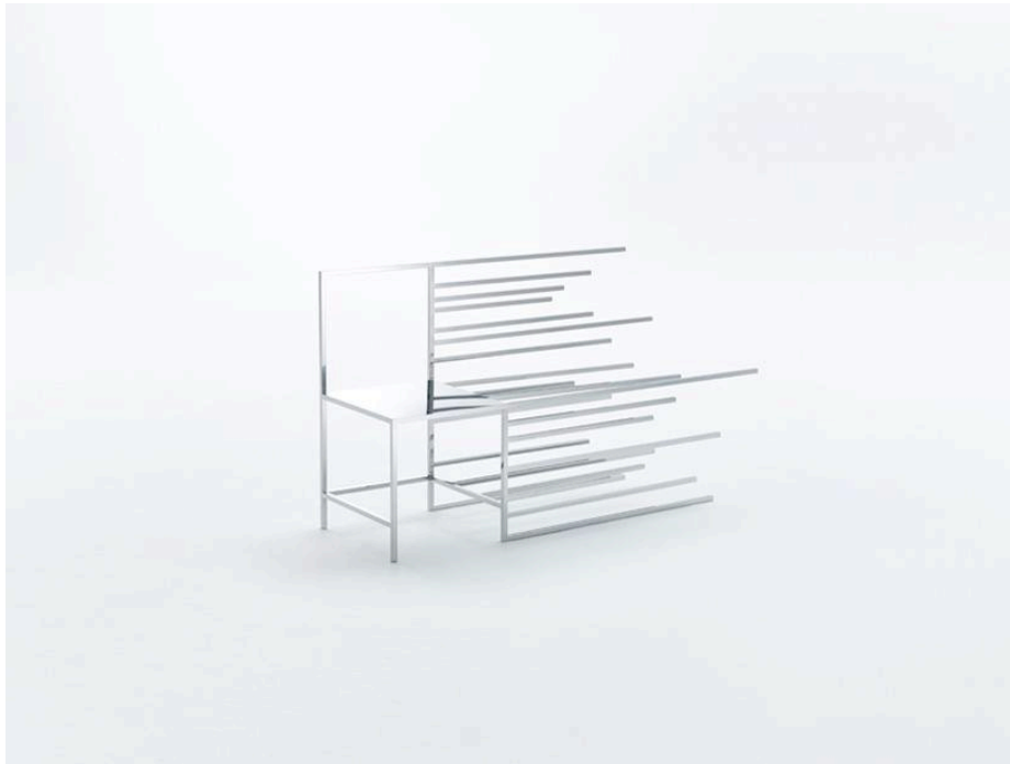
a static chair contains a sense of motion