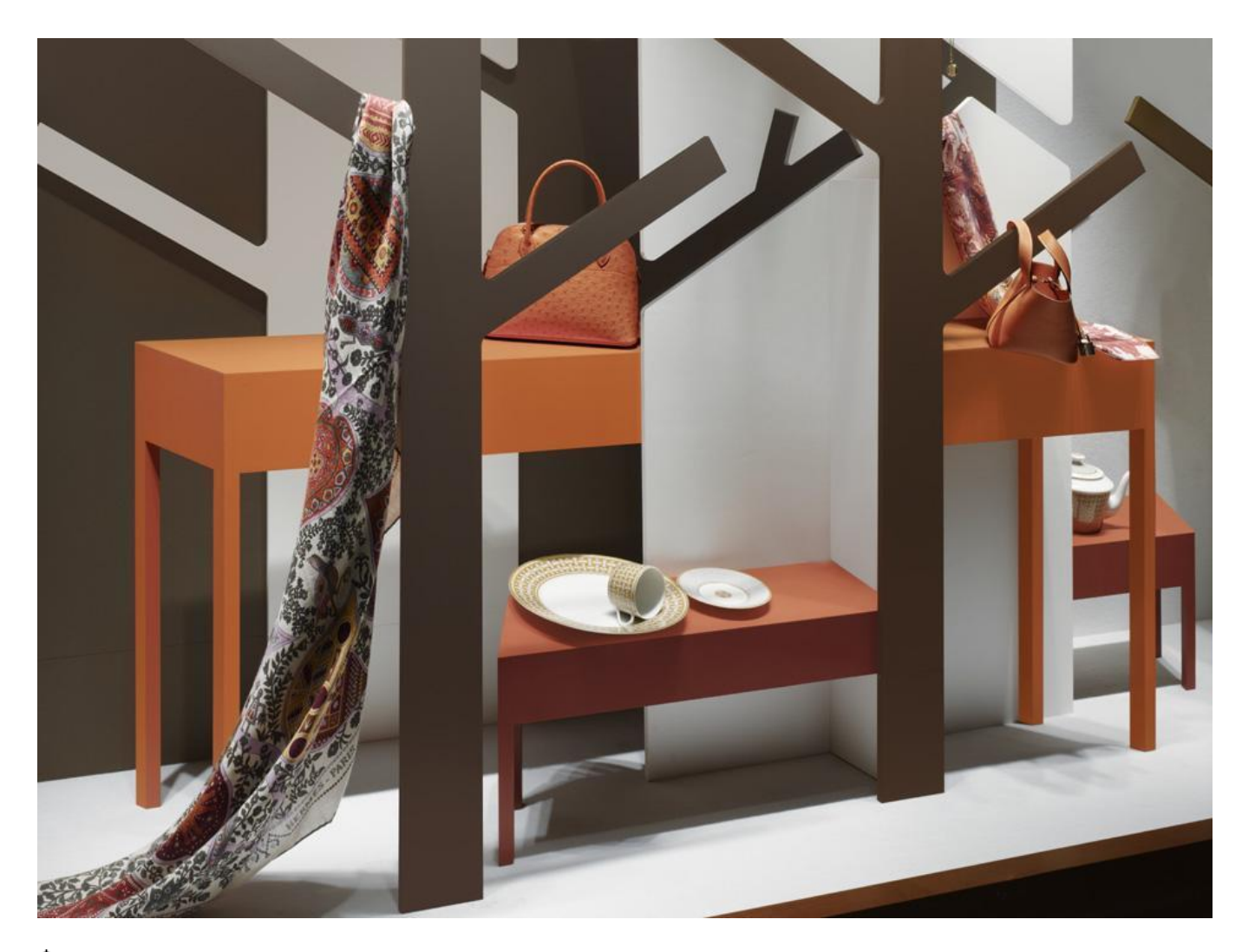
1 Nendo, Hermés window displays at Sogo Yokohama and Takashimaya Tokyo