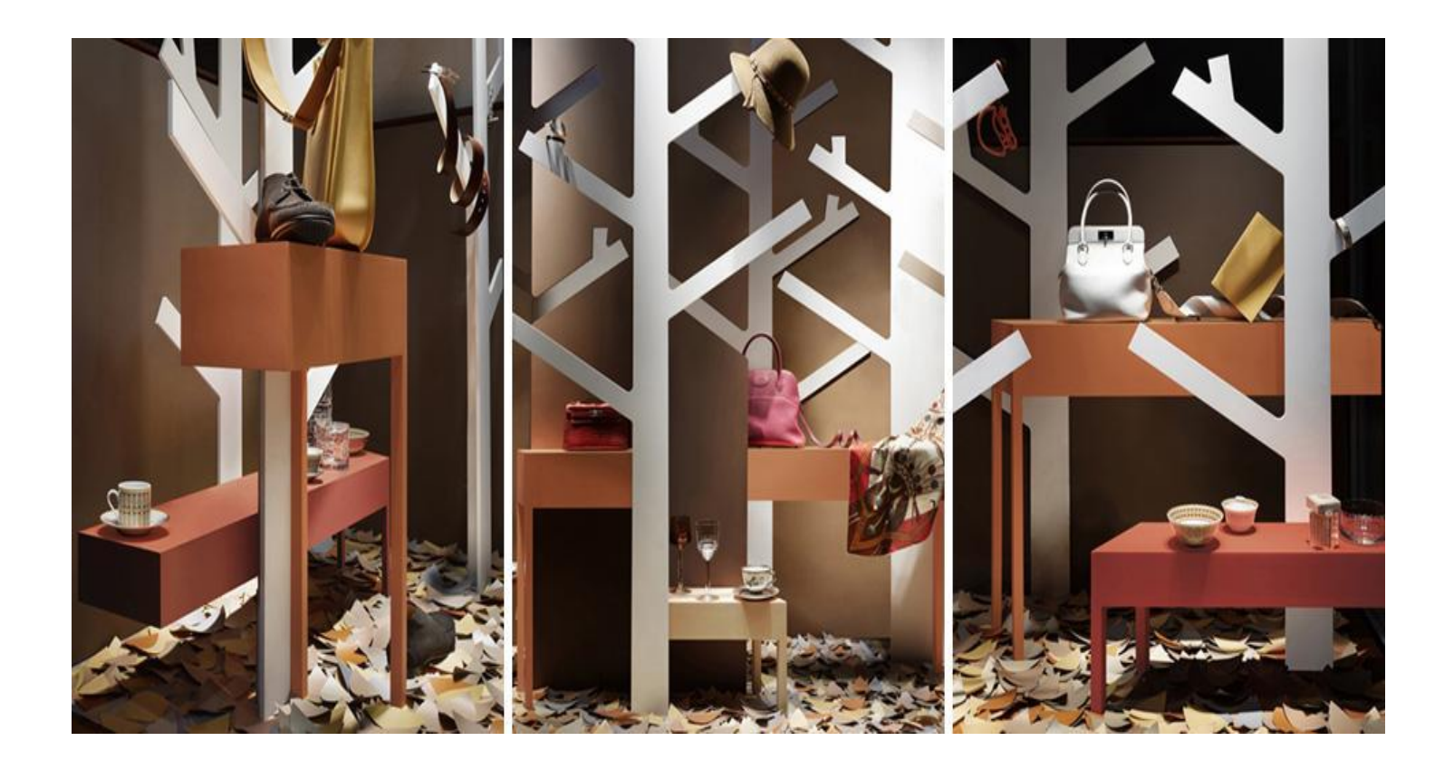
Nendo, Hermés window displays at Sogo Yokohama and Takashimaya Tokyo

Carefully arranged lighting further adds to the effect, striking shadows in a manner that further adds to the enticing nature of the tableau in which contradictions and depth suddenly appear to passers-by as their angle of vision changes.