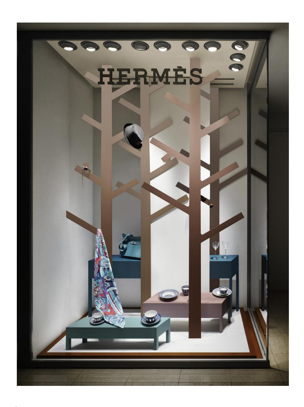
↑ Nendo, Hermés window displays at Sogo Yokohama and Takashimaya Tokyo