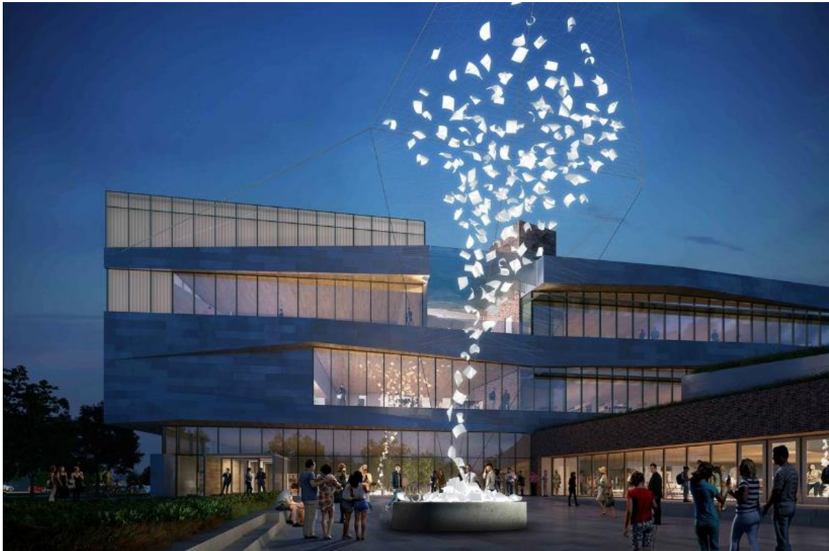
© Unbound by Paul Cockledge at the Norman Central Library