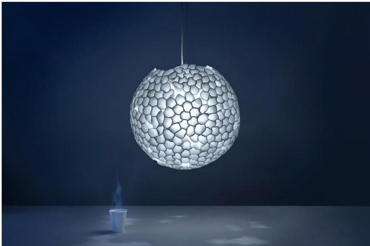
© Styrene by Paul Cocksedge for the Stepney Green Design Collection

An unfocused picture of the sun I took in Crete , sending out 360 degrees of glowing energy.