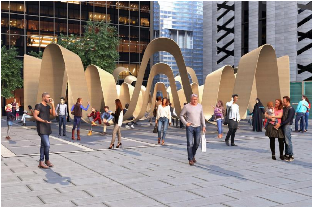
© Please Be Seated by Paul Cocksedge