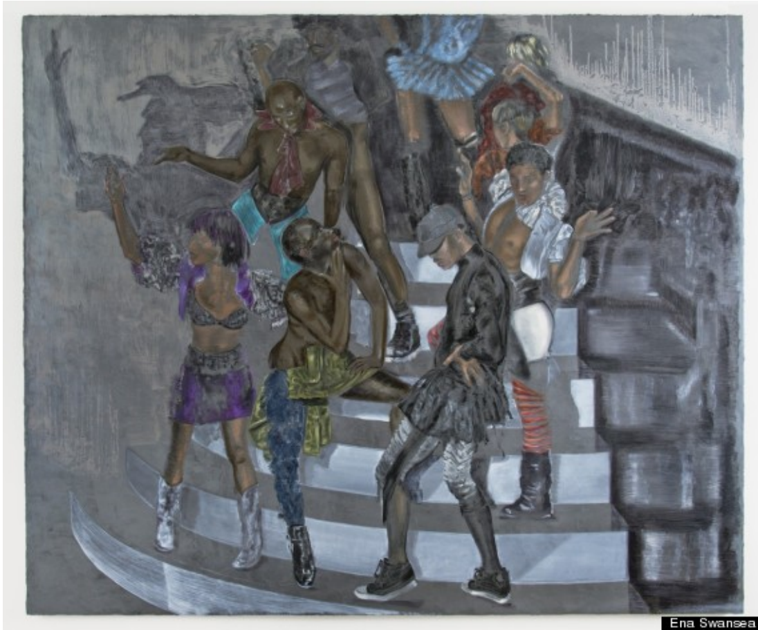
Ena Swansea [American, b. 1966], "It was late but they were not tired at all," 2013, Mixed media on canvas, 90 x 108 inches, 228.6 x 274.3 cm, signed, titled and dated on verso.

Natalie Frank's lush and grotesque paintings take a less literal approach to portraying club culture, veering from nightlife to the nocturnal. In Frank's surrealist underbelly rituals and fantasies become actualized as bodies, and masks become tangled beyond recognition. The uncanny collision of real life and hallucination mirrors the wee hours of night when dreams encroach on waking life.