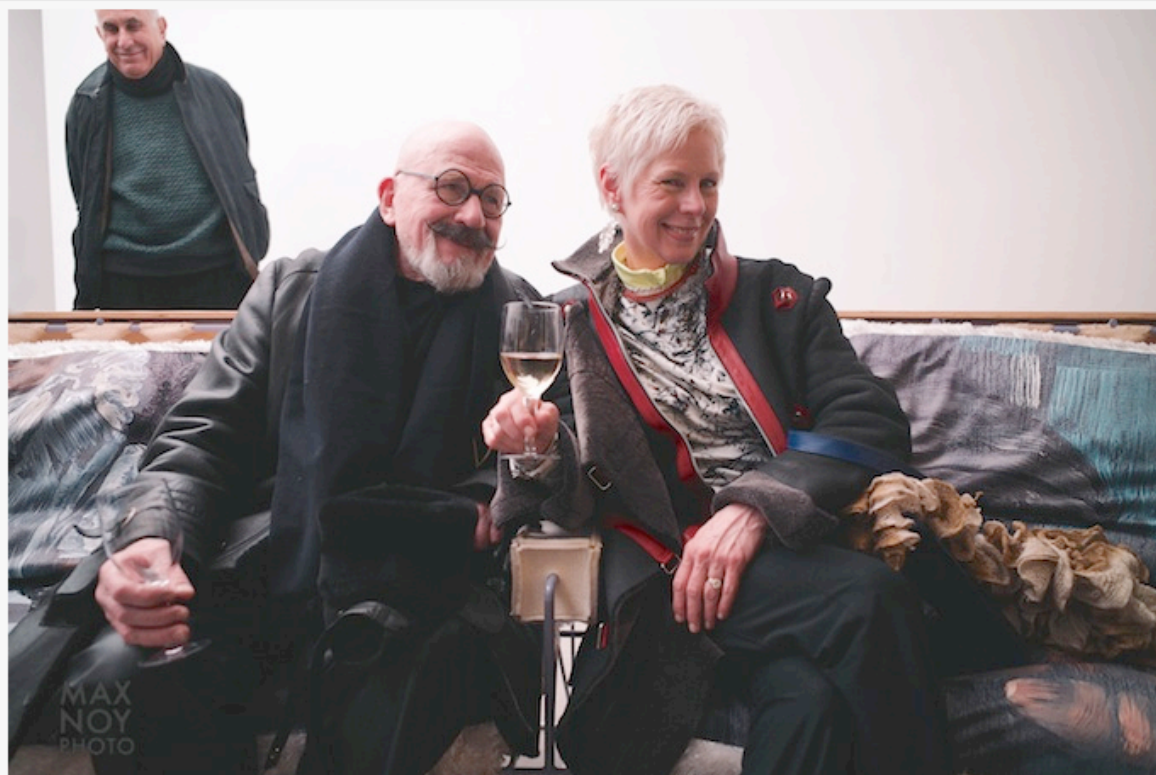
Cheers to ART night in Chelsea at Friedman Benda