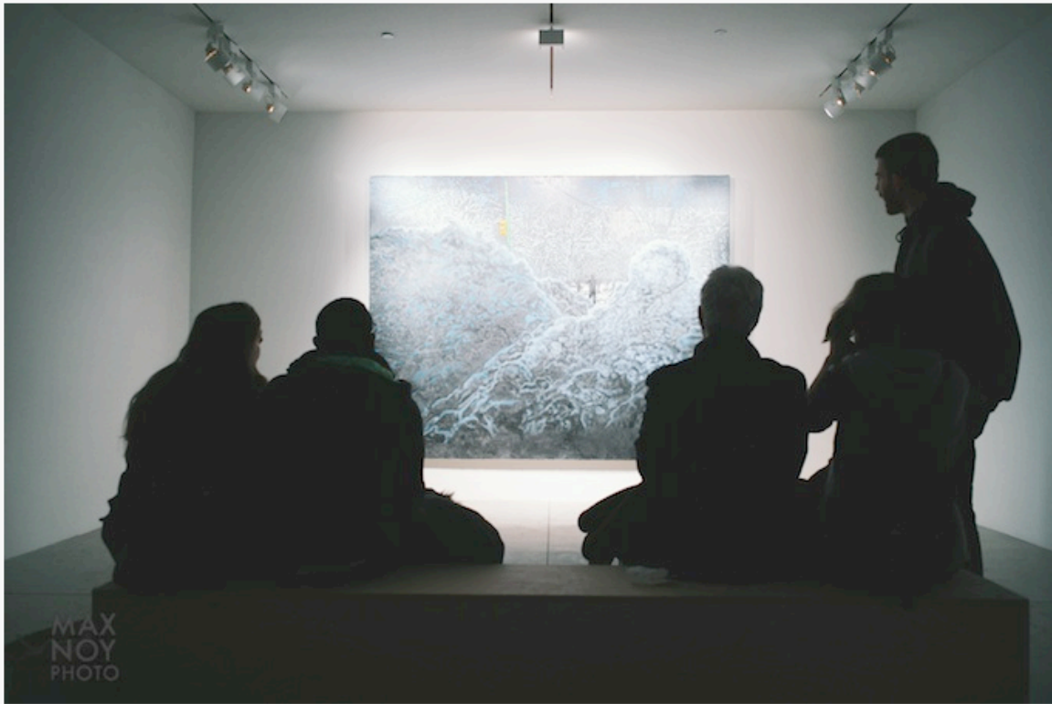
A night of art in Chelsea at Friedman Benda