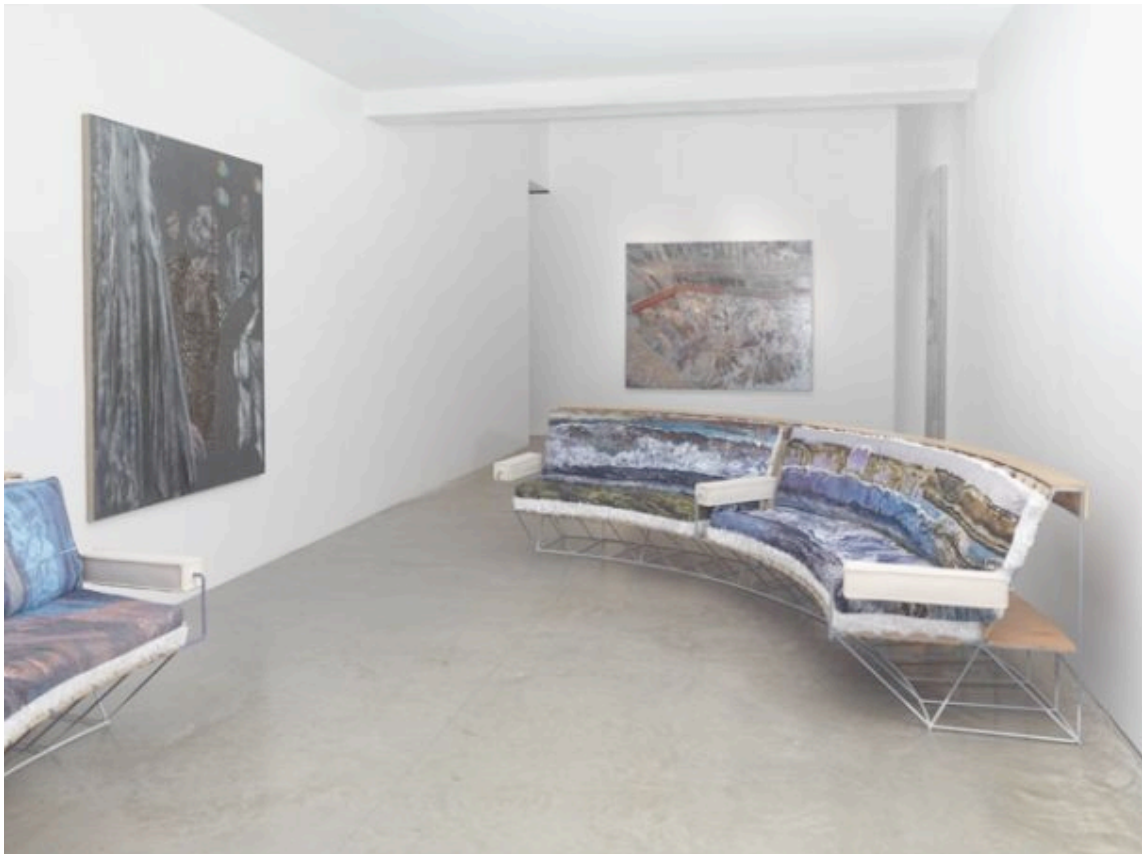
"Ena Swansea: untitled nightlife," Wall Street International . January 29, 2014. FRIEDMAN BENDA 515 W 26TH STREET NEW YORK NY 10001