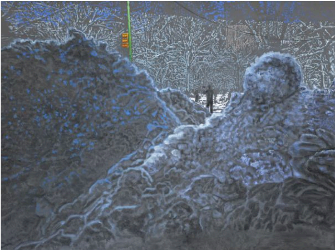
“Ena Swansea: untitled nightlife,” Wall Street International . January 29, 2014. FRIEDMAN BENDA 515 W 26TH STREET NEW YORK NY 10001