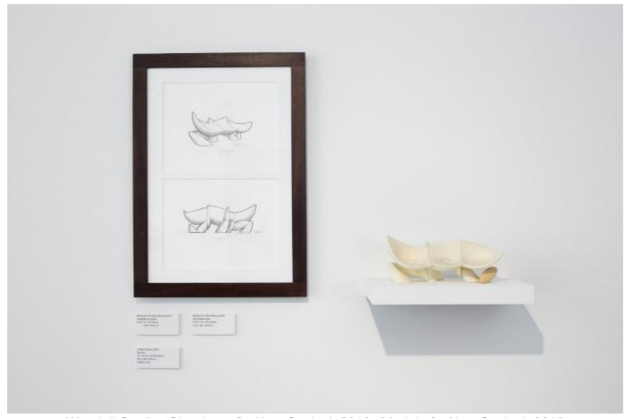
Wendell Castle, 'Sketches of a New Seeing', 2013; 'Model of a New Seeing', 2013