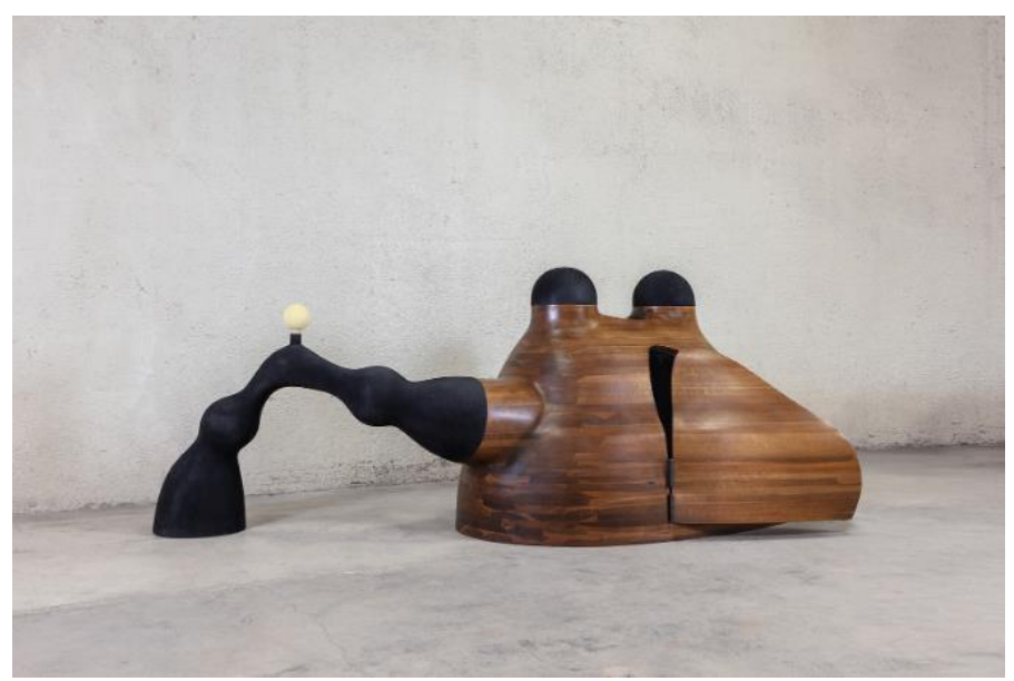
Wendell Castle, 'Environment for Contemplation', 1970