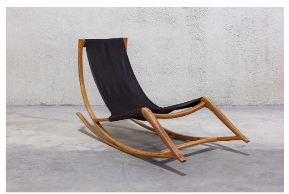
Wendell Castle, 'Chaise Rocker', 1962

By 1970, in the catalogue for the legendary 'Objects: USA' travelling exhibition that opened at the Smithsonian's Renwick Gallery, he was described as, "One of the foremost artist-craftsmen and teachers in the woodworking field." Castle, however, disliked being categorised: "I didn't want to be one of the woodies," he asserted, and continued to pursue new approaches, though he never departed from his preferred aesthetic: "To me the organic form offers the most exciting possibilities."