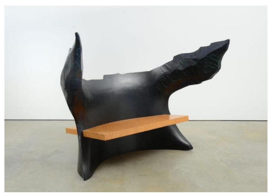
Wendell Castle, 'Harmonious Opportunities', 1990