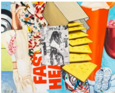
Gagosian , 980 Madison Avenue Richard Prince:Original. April 9-June 20

Skarstedt Gallery , 550 west 21 street David Salle, New Paintings. April 30-June 27