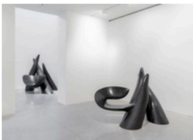
Bonakdar , 521 West 21 street. Tomas Saraceno, until May 2