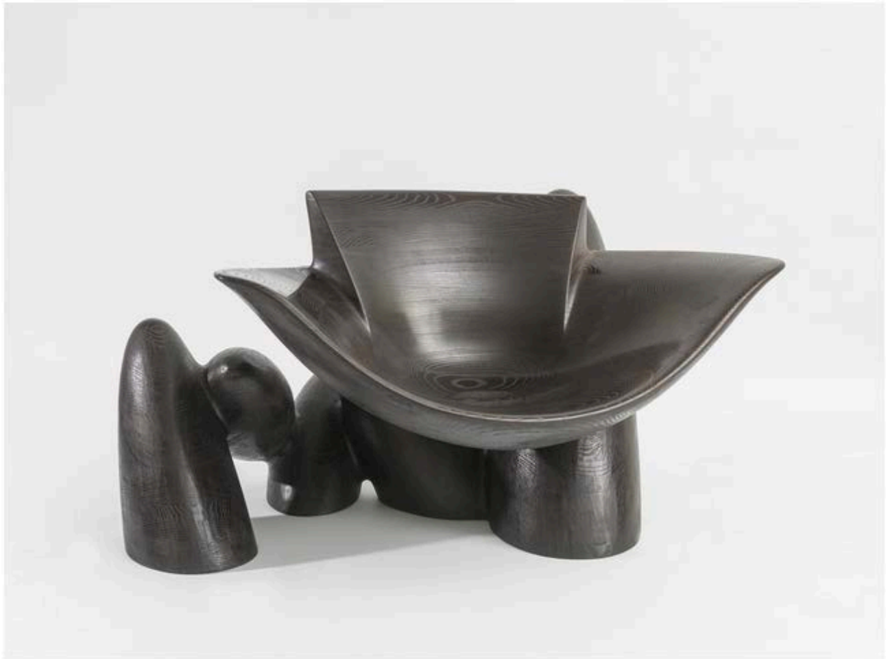
Captain's Chair, 2013, Stained Ash, 29 x 54.5 x 43 inches. Courtesy of Wendell Castle and Friedman Benda.

1 Apr–30 May 2015 at Friedman Benda Gallery, New York, United States