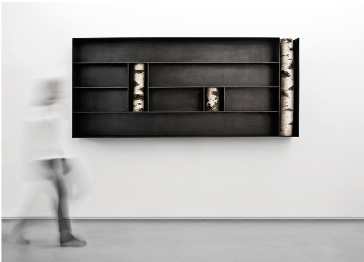
one of the shelves in 'trees', an exhibition by andrea branzi at carpenters workshop gallery paris all images courtesy carpenters workshop gallery

trees by andrea branzi carpenters workshop gallery, paris, france march 10th - may 16th, 2012