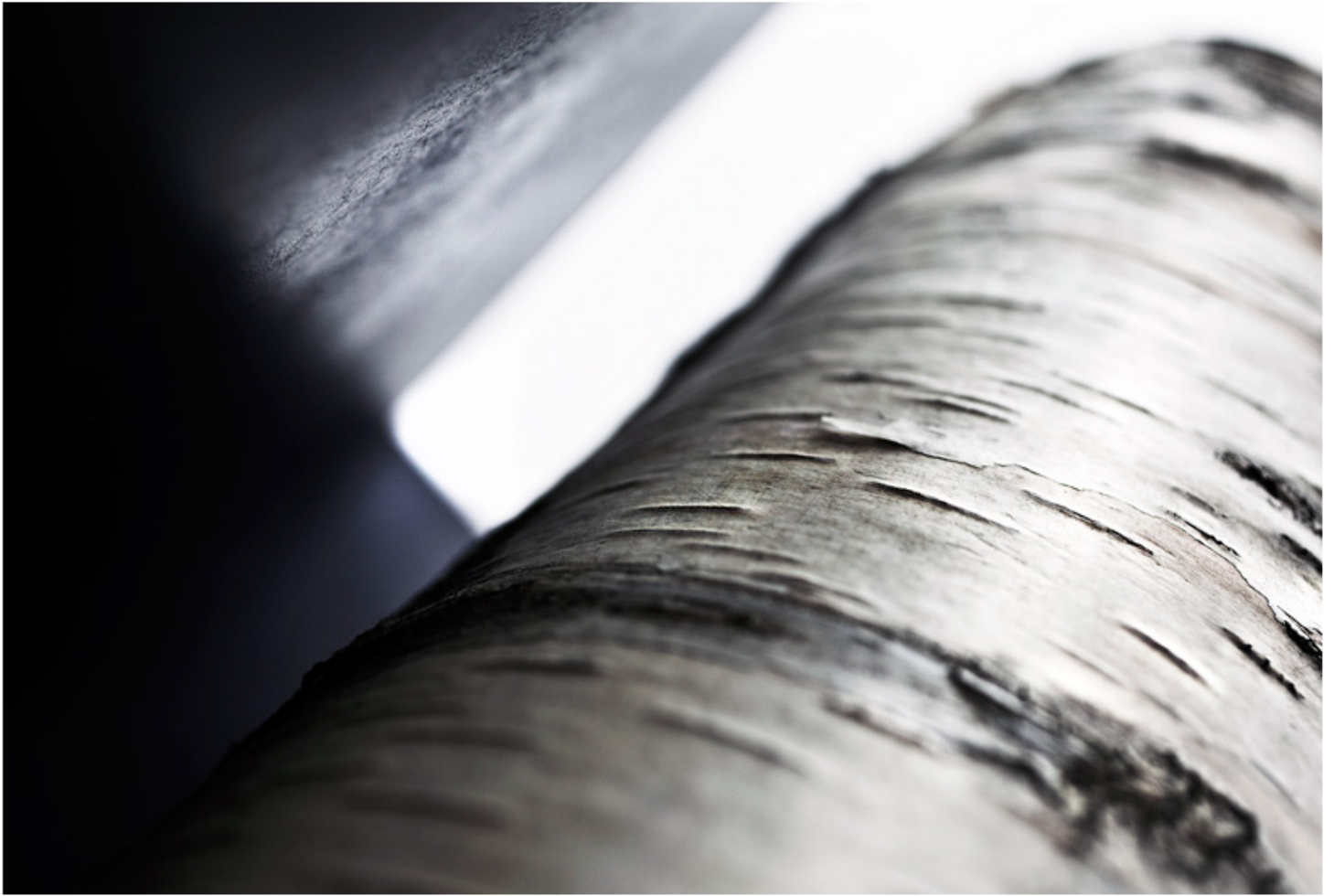
detail on branch