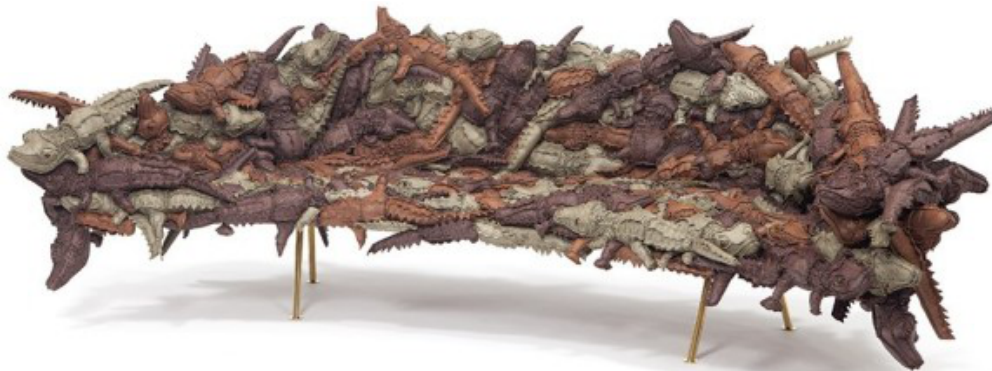
Alligator Sofa

The consanguineous design duo known as the Campana Brothers grew up in a small town of Brazil, which undoubtedly influenced their unique perspective that catapulted the designers to international recognition in the 1990s. Humberto and Fernando Campana found their niche through a process that was born out of necessity at first, and now takes on a broader historical and social implication. The brothers recently exhibited their first solo US-exhibition, on view now at Friedman Benda Gallery in New York.