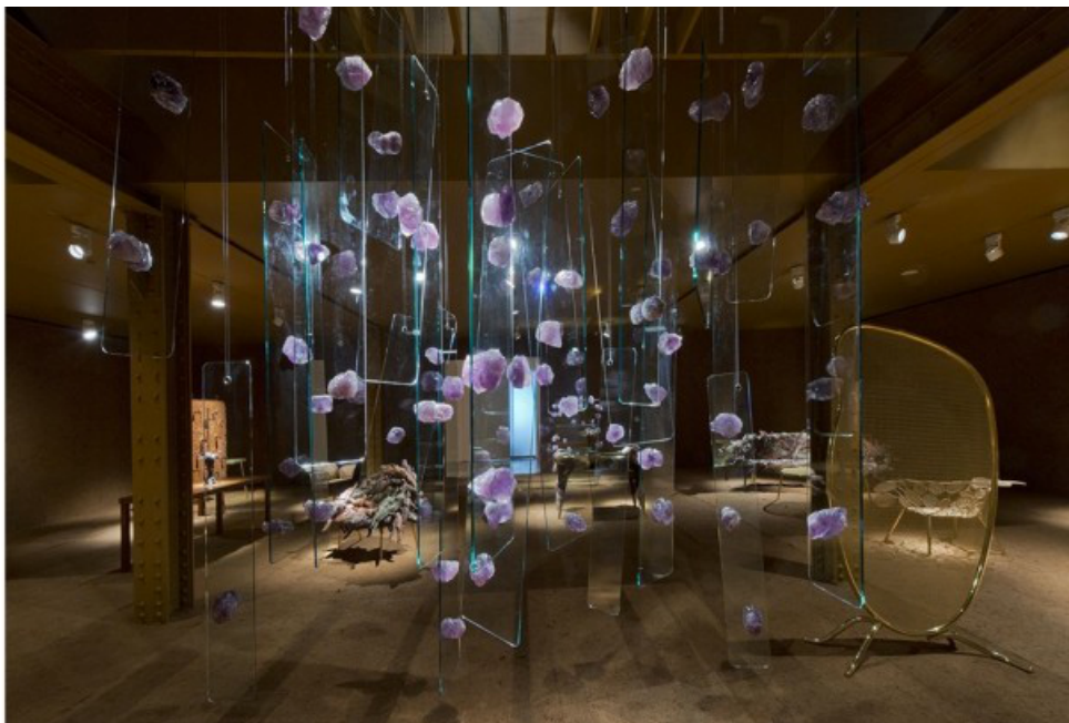
Installation view, courtesy of Friedman Benda and the artist.

The consanguineous design duo known as the Campana Brothers grew up in a small town of Brazil, which undoubtedly influenced their unique perspective that catapulted the designers to international recognition in the 1990s. Humberto and Fernando Campana found their niche through a process that was born out of necessity at first, and now takes on a broader historical and social implication. The brothers recently exhibited their first solo US-exhibition, on view now at Friedman Benda Gallery in New York.