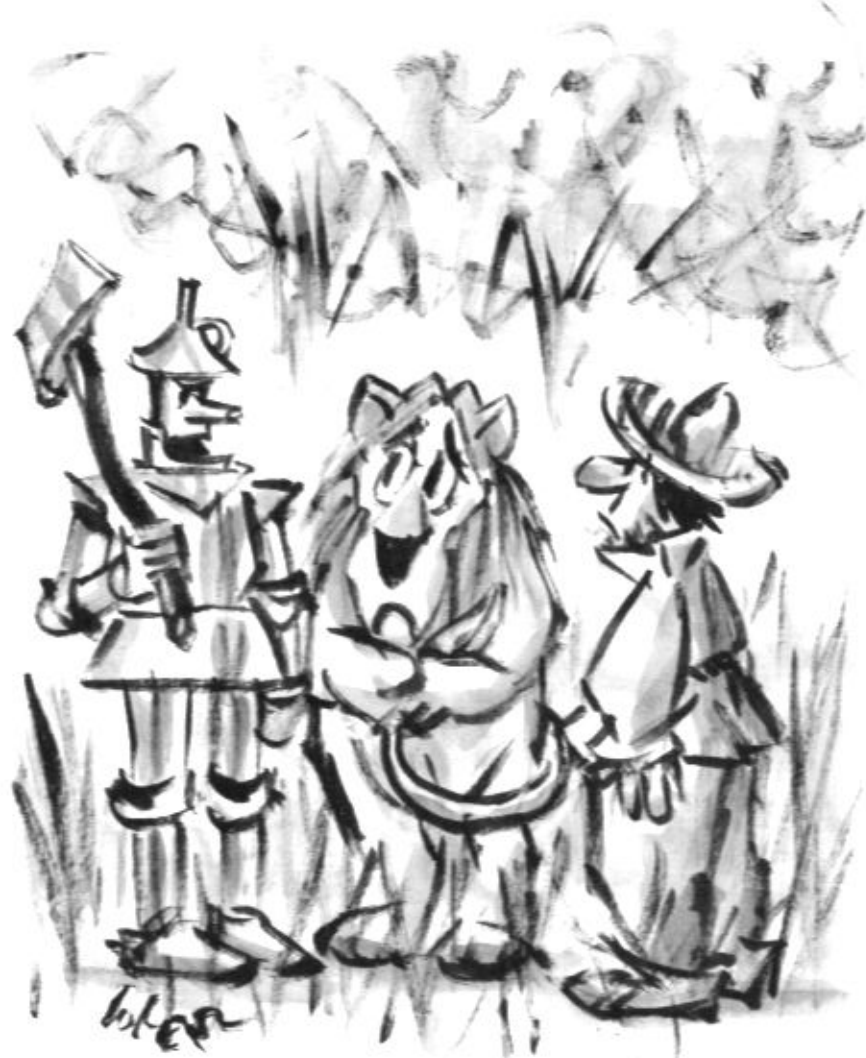
“Iron Man—why didn't I think of that?”