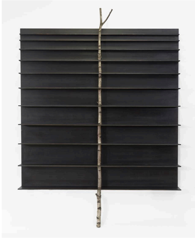
Andrea Branzi [Italian, b. 1938] Tree 5, 2010 Birch and patinated aluminum

morning. It will be on view until June 10th. All images courtesy of Friedman Benda. Above: Ron Arad, MT Rocker, 2005