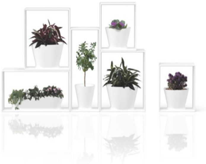
← Nendo, flower vases for Bisazza Bagno

“Bisazza Bagno by Nendo”, Domus , March 2012