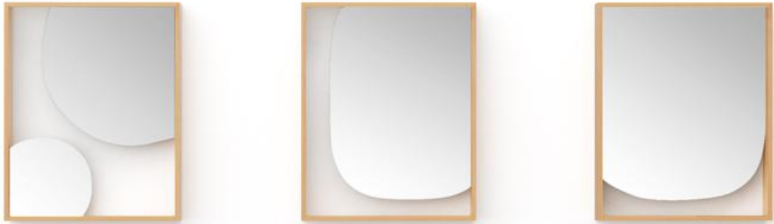
↑ Nendo, mirrors for Bisazza Bagno

“Bisazza Bagno by Nendo”, Domus , March 2012