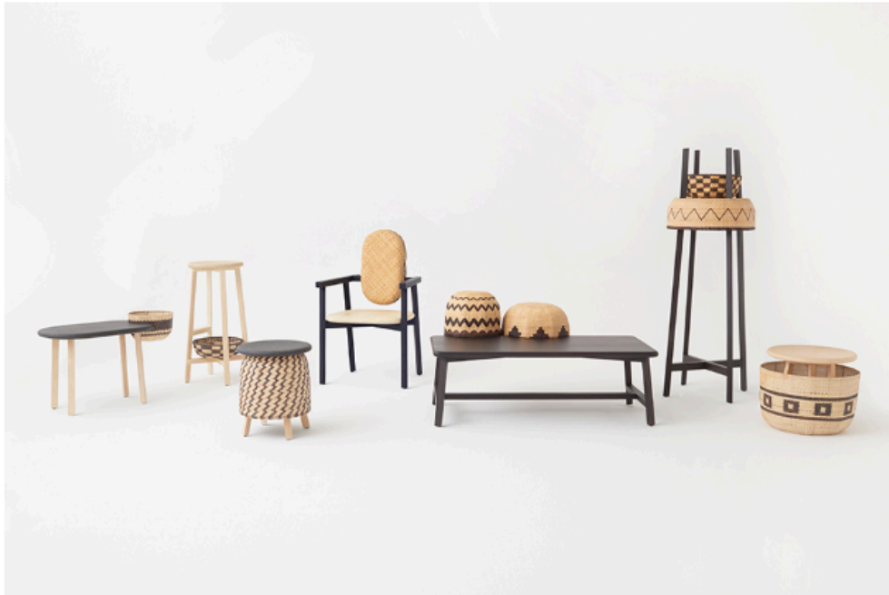
Sato created his Tokyo Tribal Collection in 2015, working exclusively in oak and bamboo rattan.