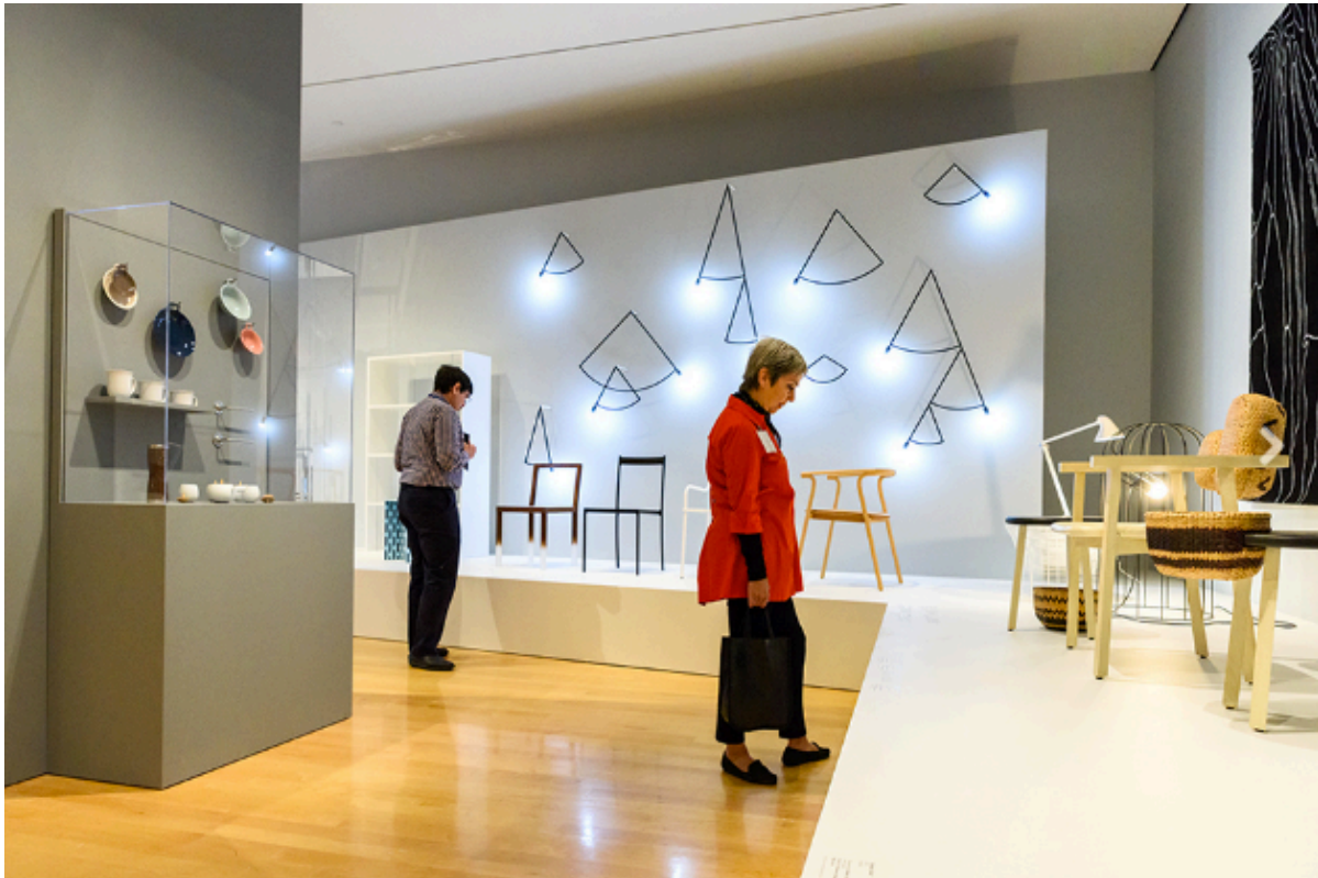
Museumgoers admire an array of Sato’s designs, including pieces from his Tokyo Tribal collection, at right, while tabletop items from his POTS series are arranged in the vitrine on the left.